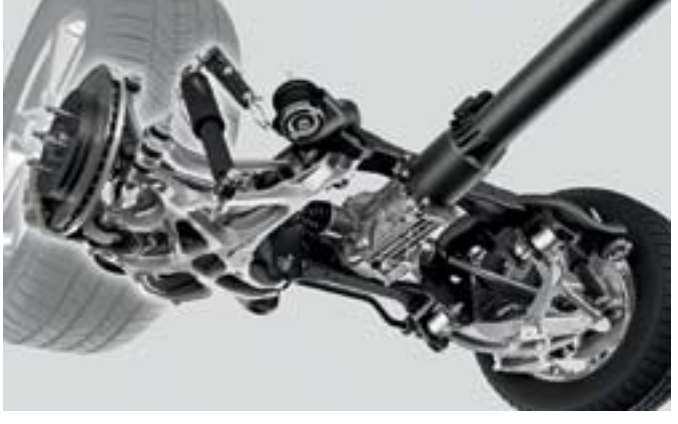
NOTHING TRUCK-LIKE ABOUT IT. Built as a body-frame integral structure, this crossover SUV rides smoothly and handles impressively well. Its exceptional comfort and agility come from a long wheelbase, wide stance and four-wheel independent suspension. For more challenging road surfaces, available intelligent all-wheel drive delivers performance and traction when you need it most.