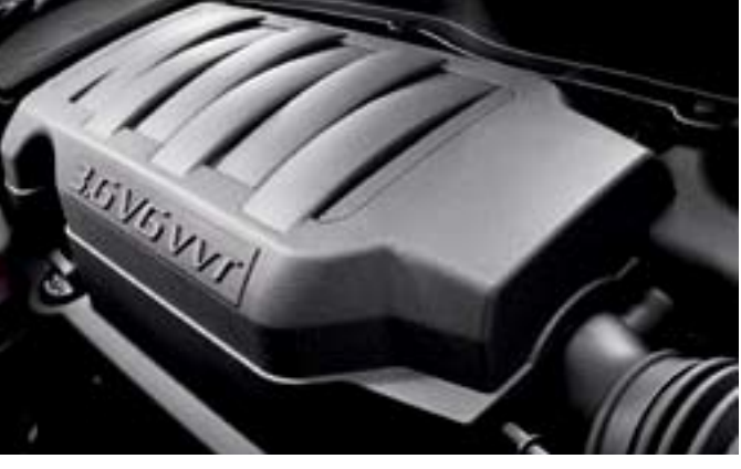
STREET SMARTS. The OUTLOOK's available 275-hp 3.6-liter V6 with Variable Valve Timing delivers performance without being greedy. Its design optimizes power, fuel economy,² emissions performance and smoothness. Enjoy a smarter approach to power, right under the hood.