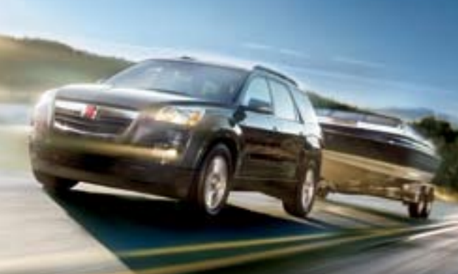
TAKE THE FUN WITH YOU. AT THE TOUCH OF A BUTTON. The OUTLOOK lets you tow up to 4,500 pounds.<sup>3</sup> Even if you're just hauling heavy cargo, the 6-speed Hydra-Matic transmission with available tow/haul mode ensures optimal towing performance. The flawless shifting, fluid acceleration and downhill control will help minimize the wear to your adventure vehicle.

Does an SUV have to drive like an SUV? Does it have to be a lumbering dinosaur from another era? Moving at the speed of prehistoric? Stopping at every gas station just out of habit?¹ Why can't a large SUV be fun to drive? Seat eight but not feel like a bus? Would this still make it an SUV? Yes, but not the kind you're used to. It's the Saturn OUTLOOK Crossover. Maybe it's time to rethink big.