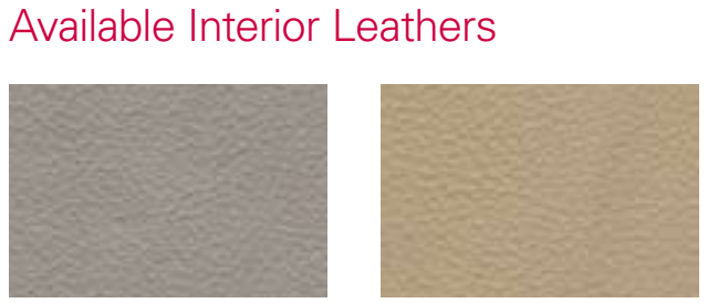
XR Tan Leather