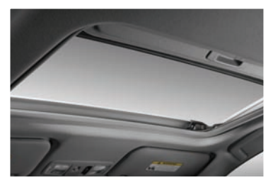
Available Power Glass Sunroof