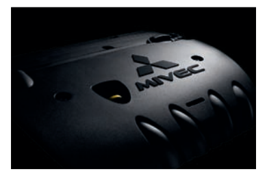
DOHC MIVEC Engines