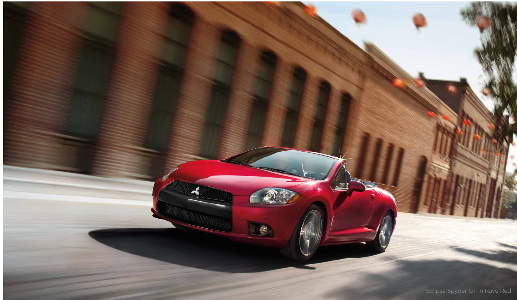
Eclipse Spyder GT in Rave Red

Sunny skies are just a push button away. Amazingly, the convertible roof goes from top up to tucked away in less than 20 seconds. It could be the ultimate attitude adjustment.