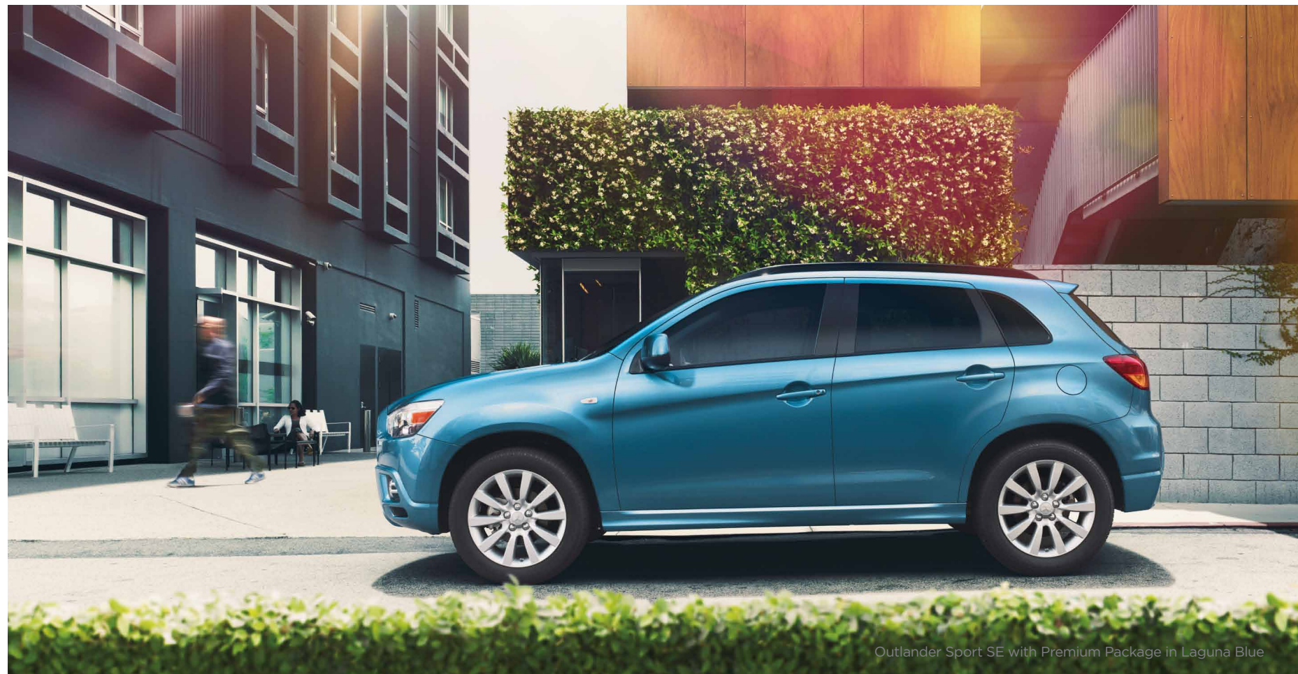
Outlander Sport SE with Premium Package in Laguna Blue

By day, the panoramic glass roof creates a fresh, open-air feeling throughout the interior. By night, the roof's LED mood lighting sets the tone for endless evening drive possibilities.