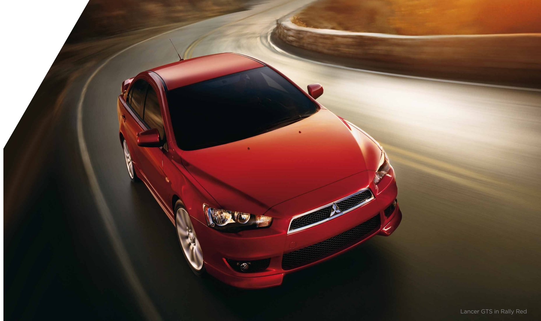
Lancer GTS in Rally Red

The Lancer is equipped with a variety of innovative safety systems that helped make it a Top Safety Pick with the Insurance Institute for Highway Safety (IIHS).