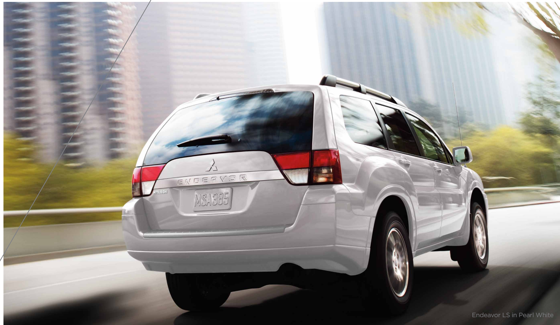
Endeavor LS in Pearl White

When the road trip calls for gear, the obliging Endeavor is at the ready with over 76 cubic feet of cargo space.