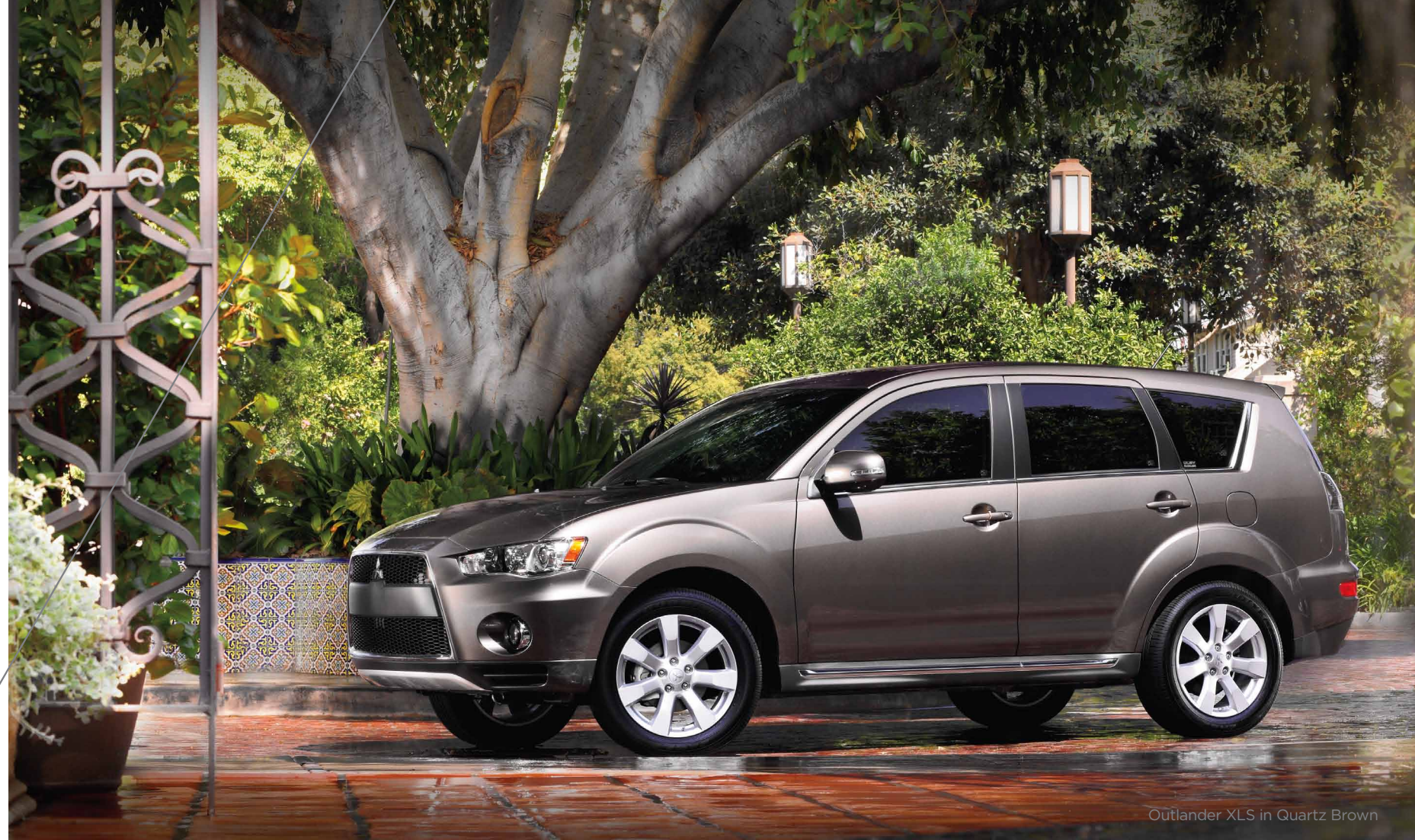
Outlander XLS in Quartz Brown

Outlander features the only two-piece flap-fold tailgate in its class. It not only makes for easy loading, it also doubles as a bench for outdoor activities, handling up to 400 pounds.