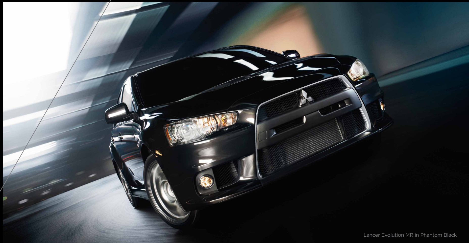
Lancer Evolution MR in Phantom Black

Lancer Evolution MR achieves a smoother ride quality with the help of high-end components, such as BBS® alloy wheels, two-piece brake rotors, Bilstein® shocks and Eibach® springs.