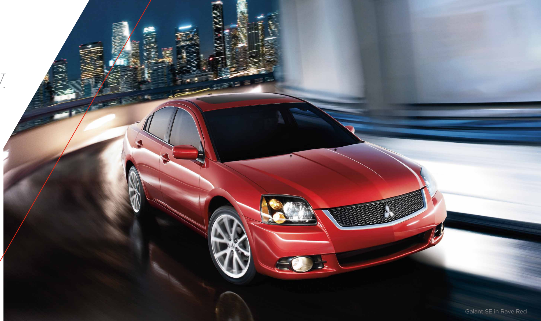
Galant SE in Rave Red

Add a note of sporty style to Galant comfort with these sharp 18-inch alloy wheels.