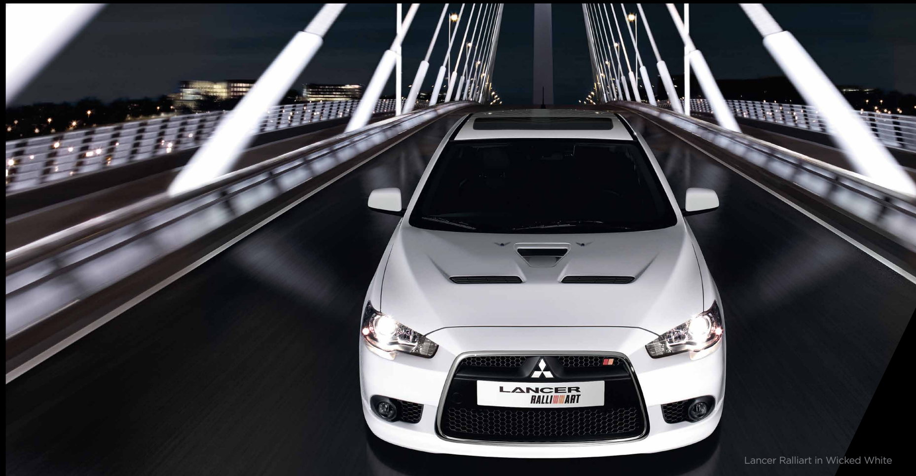
Lancer Ralliart in Wicked White

The power within Lancer Ralliart springs from a 2.0-liter single-scroll turbocharged engine producing 237-horsepower @ 6,000 rpm. Plus, a mighty 253 lb.-ft. of torque is on tap from 2,500 rpm through 4,750 rpm. To handle the extra power, Ralliart gets a larger front stabilizer bar and firmer springs and dampers.