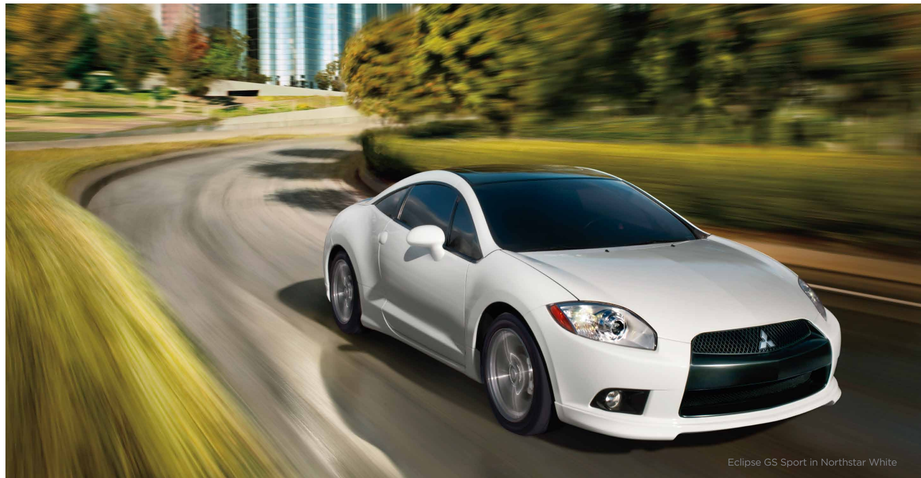
Eclipse GS Sport in Northstar White

Eclipse's High-Intensity Discharge (HID) headlamps are brighter than normal headlamps and emit a beam that more closely mimics the light of the sun, making for better definition and less eye fatigue.