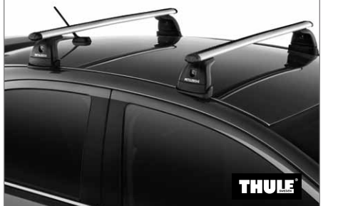
Thule® Integrated Roof Rack

In addition to the wide-open loading advantage Add even more storage options to your of Sportback, ES and GTS trim levels offer a dual level cargo floor. With a 60/40 splitfolding rear seat and a handy cargo lever that cargo boxes to choose from, it gives quickly drops the seatbacks, you get versatility versatility top priority. on top of versatility.