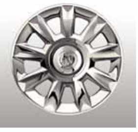
P6A 19" 9-spoke chrome-clad aluminum