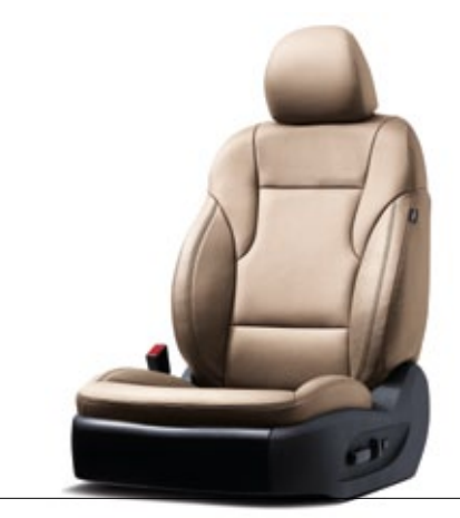
8-WAY POWER DRIVER SEAT

Open the trunk lid: That's 16.4 cubic feet of cargo room just waiting to be filled. So go ahead, volunteer to drive the entire foursome to the golf course.