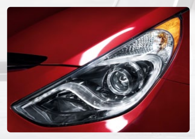
SONATA HYBRID HEADLIGHT

Engineering artistry even extends to the painting process, where an advanced rotational dip method uses opposing electrical charges to pull primer and paint onto every nook and corner of Sonata's chassis and body, offering protection from the elements and the effects of salt, rust and corrosion.