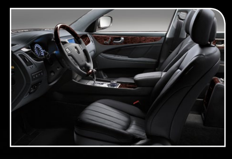
JET BLACK LEATHER / GENUINE WALNUT WOOD