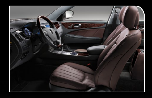
SADDLE BROWN LEATHER / GENUINE WALNUT WOOD