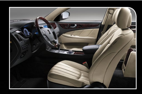
CASHMERE BEIGE LEATHER / GENUINE BIRCH BURL WOOD