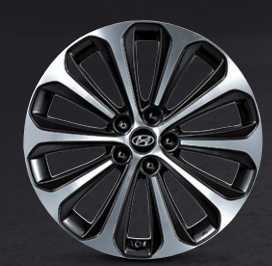
19" PREMIUM MACHINED-FINISH ALUMINUM ALLOY WHEELS