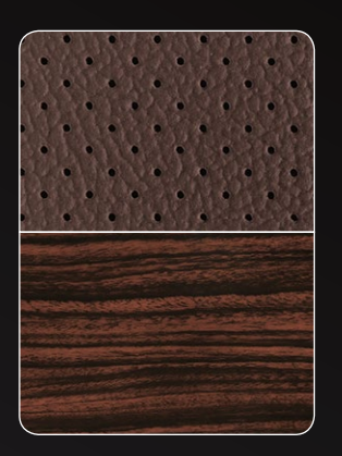
JET BLACK LEATHER / BLACK MAPLE WOOD