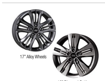
18" Diamond Cutting Alloy Wheels