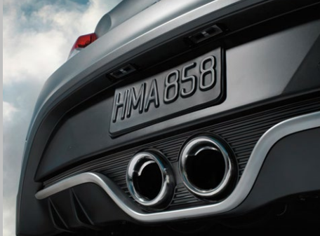
PERFORMANCE AND SAFETY HIGHLIGHTS (See specifications section for availability by model)