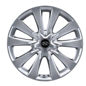
19" Alloy Wheel Limited