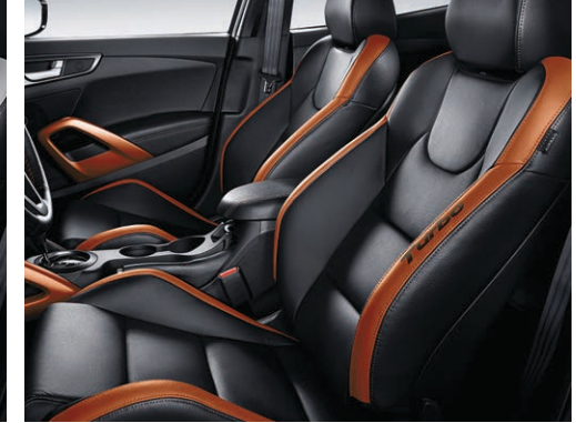
Black Leather with Orange Accents