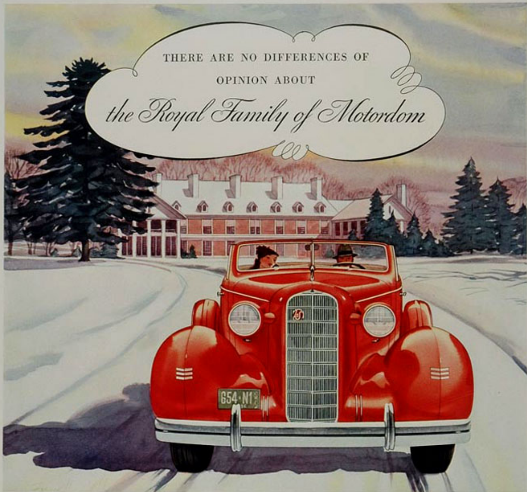
La Salle Convertible Coupe $1255