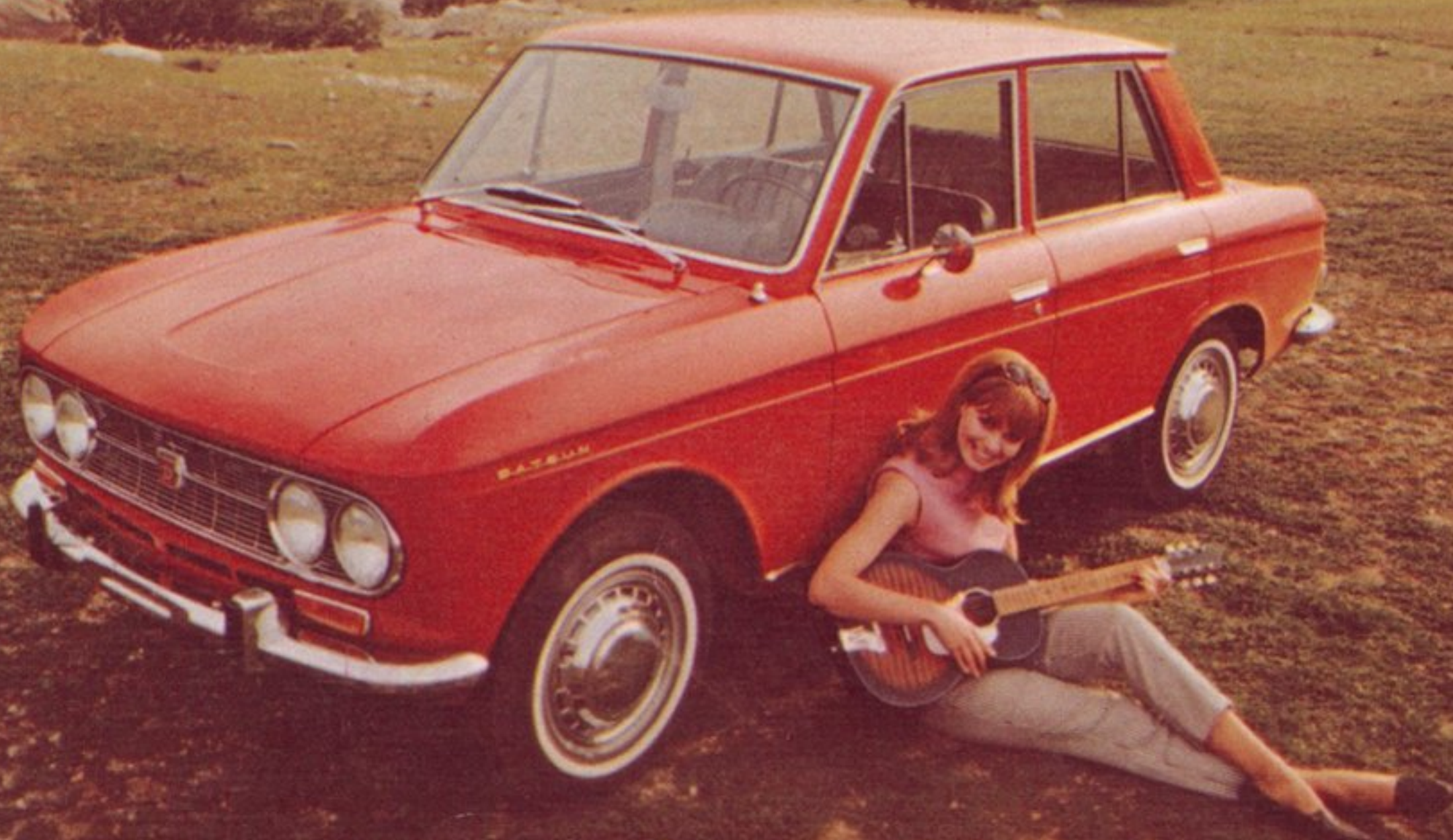
DATSUN 4-DOOR SEDAN