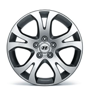
18-INCH ALLOY WHEEL