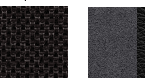
Carbon Black Checkered Cloth (CBCC)