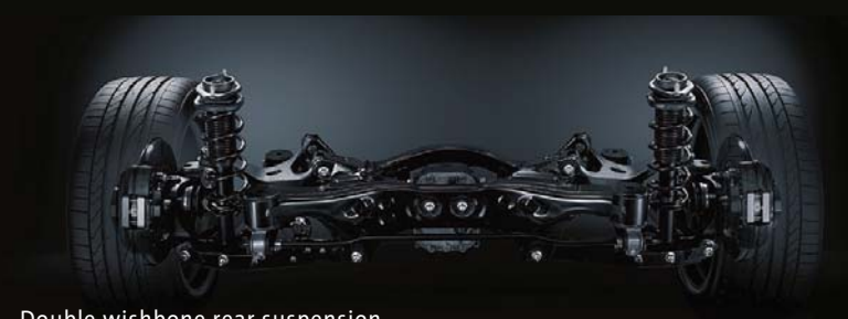
Double wishbone rear suspension