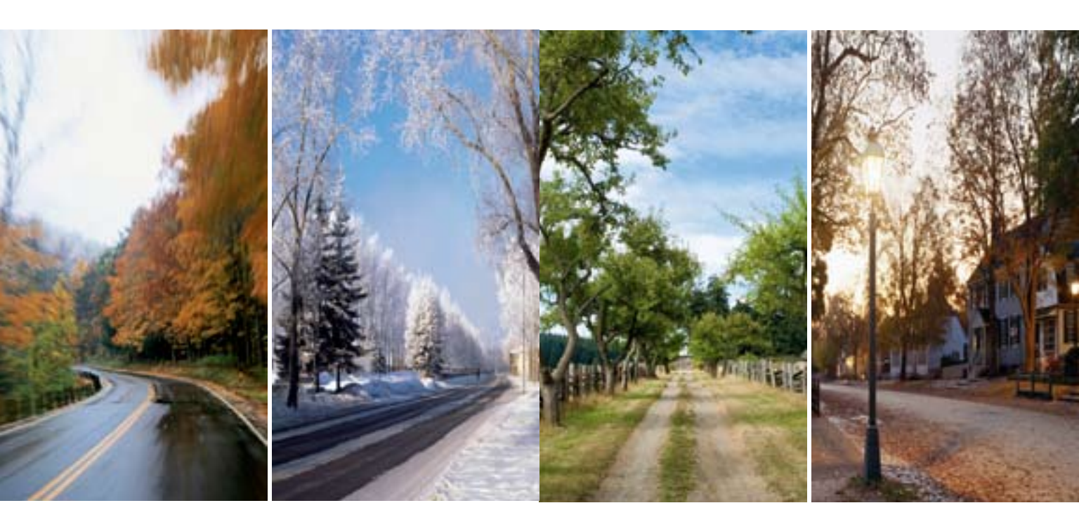
All wheels. All roads.