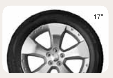
2.5XT—Premium and Touring