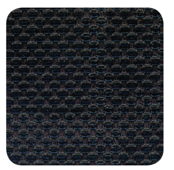
Black Moray Cloth (BMC)