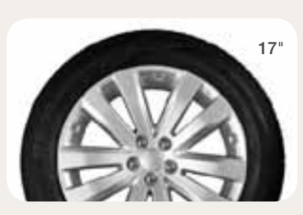
2.5X—Premium, Limited and Touring