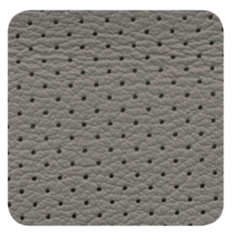
Platinum Leather (PL)