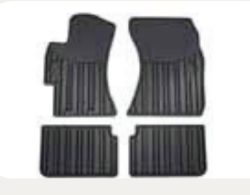
All-weather Floor Mats

Helps protect upper surface of painted rear bumper from scratches and dings during loading and unloading.