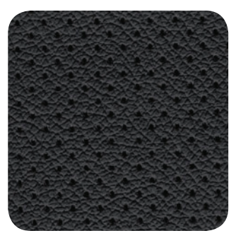
Black Leather (BL)