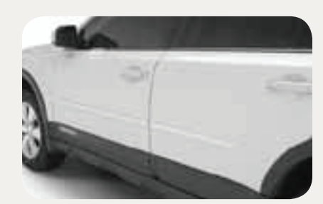
Body Side Moldings

Mirror darkens when headlights are detected from behind the vehicle. Includes a compass and three integrated HomeLink® buttons that are programmable for most garage-door openers and other HomeLink-compatible devices.