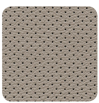
Warm Ivory Leather (WIL)