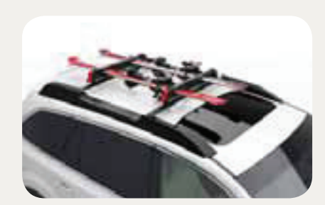
Ski and Snowboard Carrier

Not for use with child seats requiring tether straps.