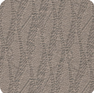
Warm Ivory Cloth (WIC)