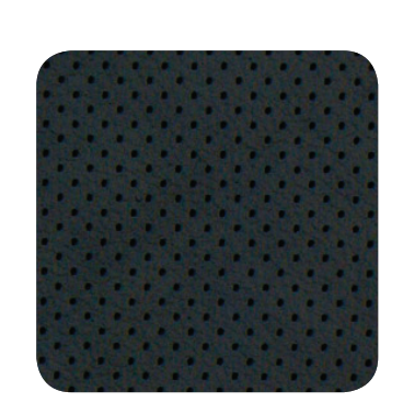
Off-Black Leather (OBL)