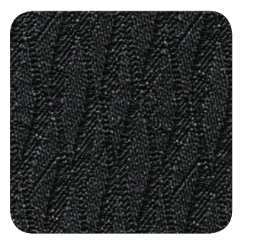
Off-Black Cloth (OBC)