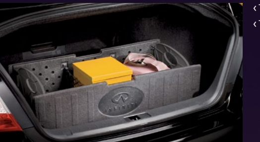
Trunk cargo trayTrunk organizer