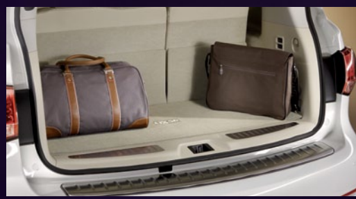
Hatch tent Carpeted cargo mat<sup>16</sup>