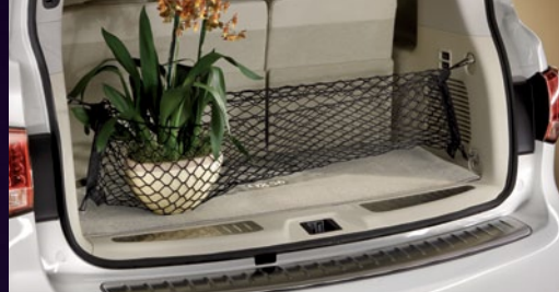
Cargo area protector<sup>16</sup> Cargo net<sup>16</sup>