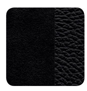
Black Alcantara®/ Carbon Black Leather (BA)