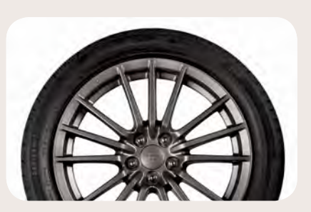
17 x 8.0-inch 5-tri-spoke aluminum-alloy wheels