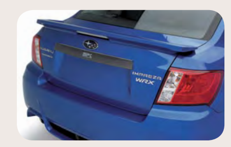
SPT Carbon Fiber Trunk Trim

Replacement oil cap and battery hold down are manufactured from billet aluminum, anodized in Steel Gray or SPT Blue and feature laser-etched