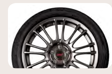
18 x 8.5-inch 9-split-spoke BBS® aluminum-alloy wheels WRX STI 5-door and WRX STI Limited 4-door