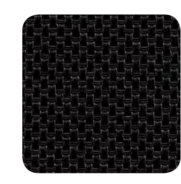
Carbon Black Checkered Cloth (CBCC)