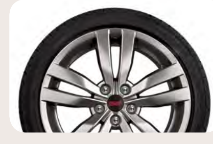
18 x 8.5-inch 5-split-spoke aluminum-alloy wheels WRX STI 4-door