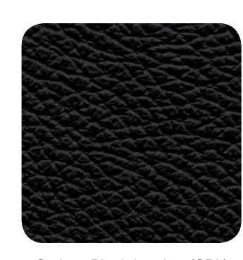
Carbon Black Leather (CBL)