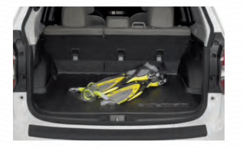
Cargo Tray. Tough, durable tray helps protect cargo area. Can be easily removed and rinsed clean.