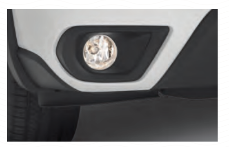
Fog Light Kit. Casts a low and wide beam of light to enhance vision in inclement weather.

Aero cross bars shown with heavy-duty roof cargo basket.