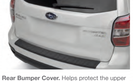
surface of painted rear bumper from scratches and dings.