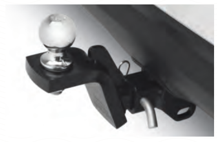
Trailer Hitch. Rated at 176 lbs tongue weight with 1,500 lbs of towing capacity. Engineered to the same rigorous standards as the rest of the Forester.

Hitch Ball not included. Trailer brakes may be needed.