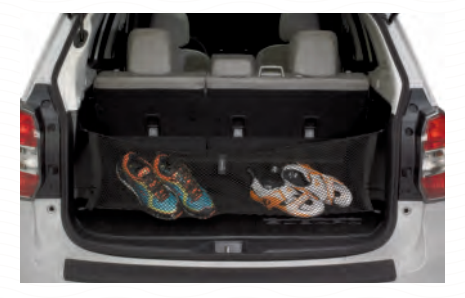
Cargo Net - Rear. Neatly holds cargo and prevents it from sliding while the vehicle is in motion.