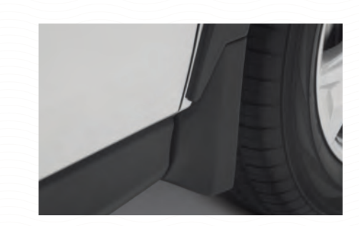
Splash Guards. Helps protect the vehicle's paint finish from stones and road grime.

Hitch Ball not included. Trailer brakes may be needed.