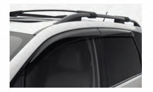
Side Window Deflectors. Let the fresh air in while helping to keep the weather out. Black acrylic plastic construction is designed specifically for an exact fit. May not be legal in all states. Please check your state laws.