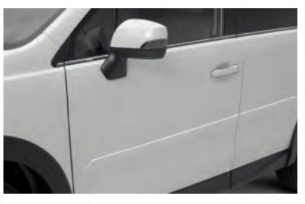
Body Side Moldings. Color-matched moldings help protect vehicle doors from parking lot dings, while attractively blending with the lines of the car.