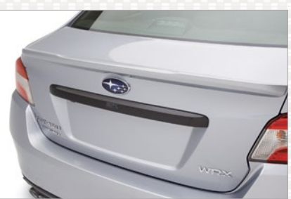
SPT Carbon Fiber Trunk Trim. Give the WRX and WRX STI that high-tech look with this carbon fiber accent. The trim piece is made from real carbon fiber and has the SPT logo embedded in the clear coat.