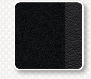
Black Alcantara®/ Carbon Black Leather (BA)