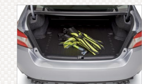
Rear Cargo Tray. Helps protect cargo area from dirt and spills. Can be easily removed and rinsed clean.