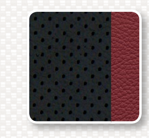
Carbon Black Leather/Red Bolster Accent (CBLR)