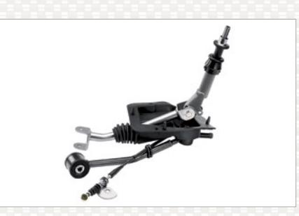
STI Short-throw Shifter. Significantly reduces shift throw lengths for crisper shifts and sportier driving feel. WRX STI Shifter shown.