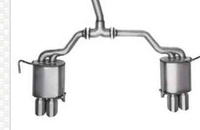
STI Performance Exhaust Systems. These exhaust systems feature smooth mandrel bend construction to help reduce exhaust flow restriction. STI system shown.