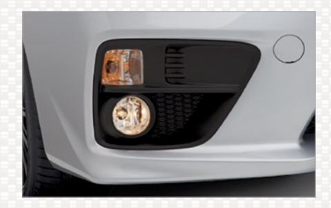
Fog Light Kit. Casts a low and wide beam to help enhance vision in inclement weather.