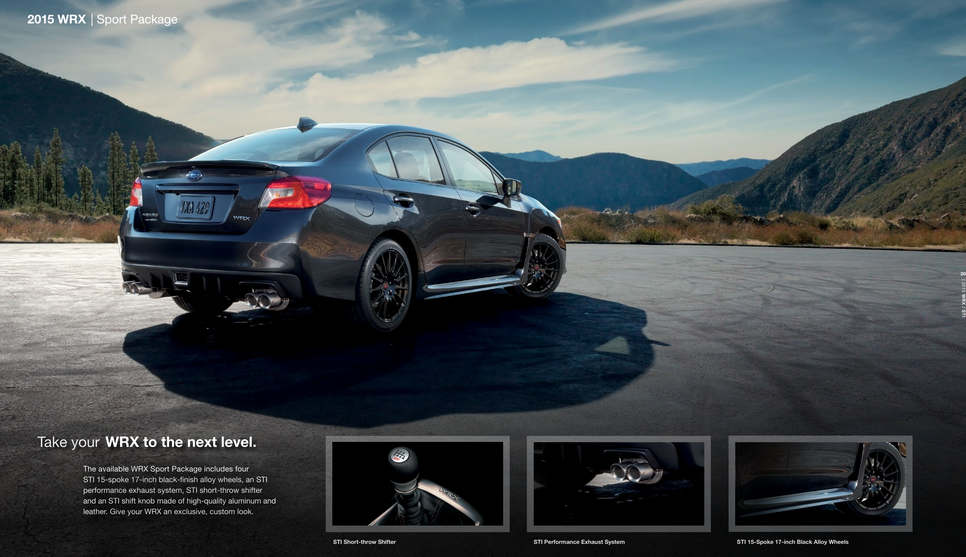
WRX Premium in Dark Gray Metallic with accessory Sport Package.