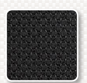
Carbon Black Checkered Cloth (CBCC)