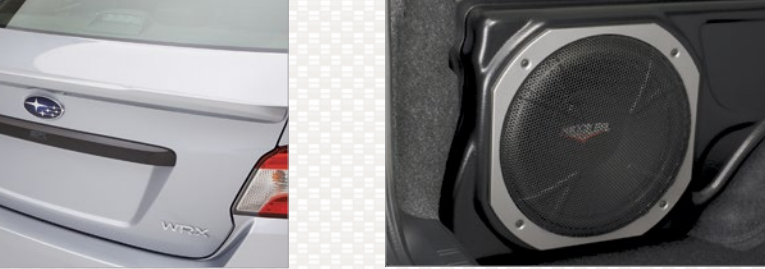
10-Inch Powered Subwoofer. The 10-inch powered subwoofer provides powerful deep bass and clean sound reproduction with its integrated 100W amplifier and a passive crossover network. Manufactured for Subaru