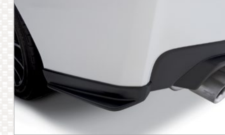
STI Rear Quarter Under Spoiler. Complete the ground-hugging look to the side of the WRX or STI with the addition of the rear quarter under spoilers. Kit includes both left and right under spoilers.