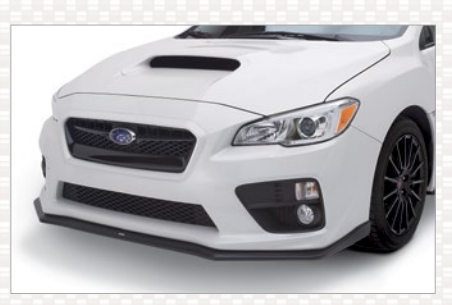
STI Front Under Spoiler. STI Front Under Spoiler gives the WRX and STI models a mean, ground-hugging attitude.