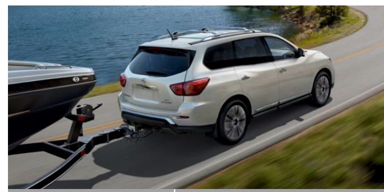
TRAILER TOW PACKAGE<sup>5</sup> | SV, SL