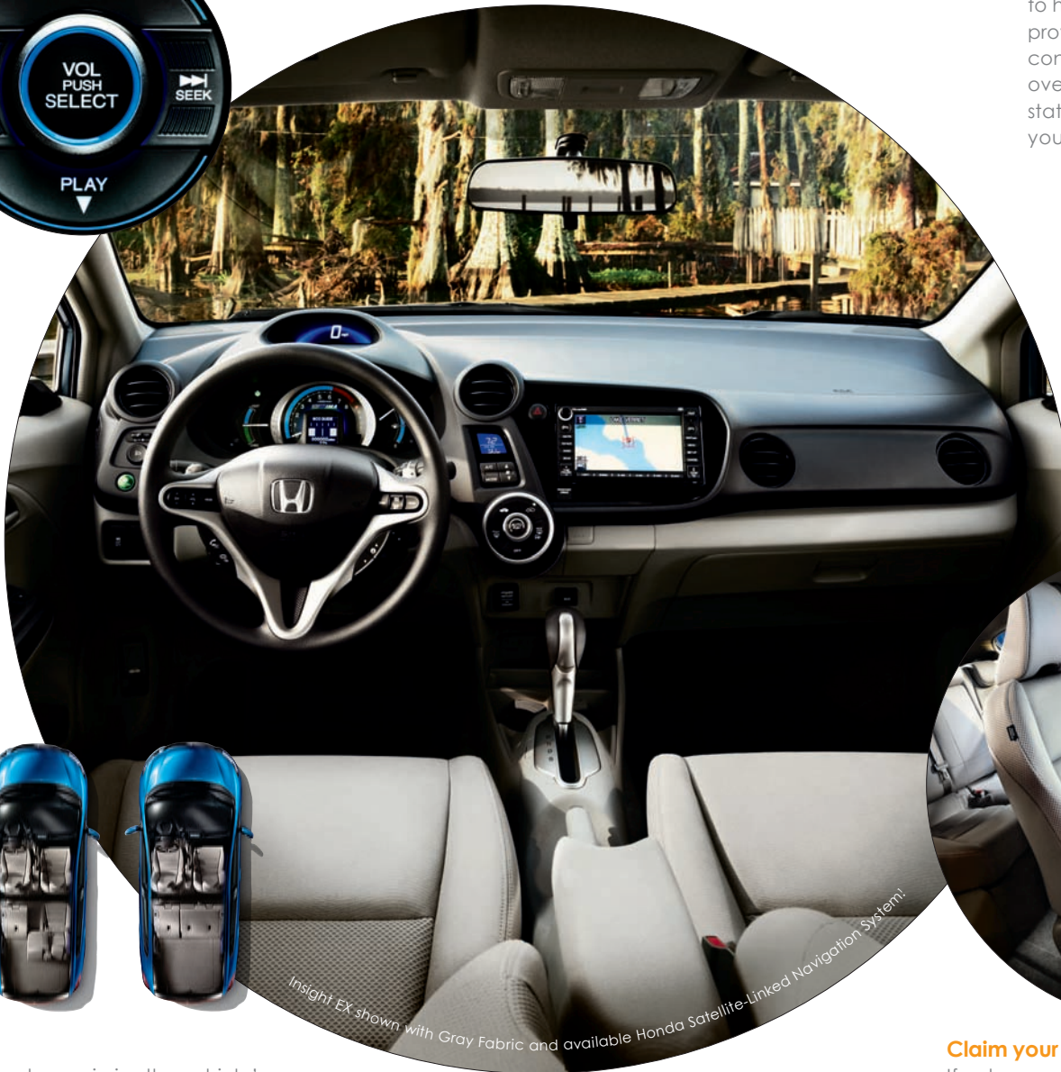
Insight EX shown with Gray Fabric and available Honda Satellite-Linked Navigation System†