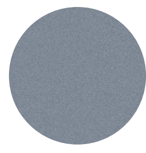
FORGED SILVER METALLIC Ebony Leatherette • Ebony Leather Graystone Leather • Seacoast Leather