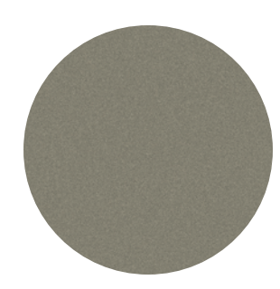
GILDED PEWTER METALLIC Seacoast Leather