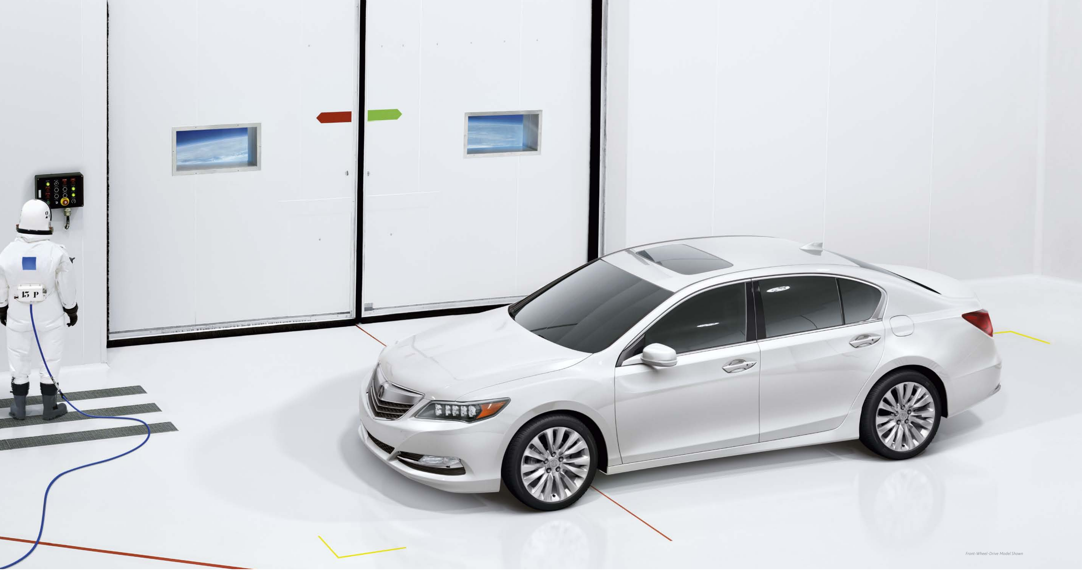
Arriving late 2013, the Acura RLX Sport Hybrid will reinvent the gasoline/electric hybrid concept, creating sports-car performance with an environmental pedigree. Energy-regeneration technology headed for the Acura NSX Supercar helps deliver large-displacement performance of 370 hp — with 4-cylinder fuel economy in the range of 30 mpg rating on the highway. At each rear wheel, individual electric motors provide independent torque control to accomplish the incredibly tight cornering possible through the Acura Sport Hybrid Super Handling All-Wheel Drive system.