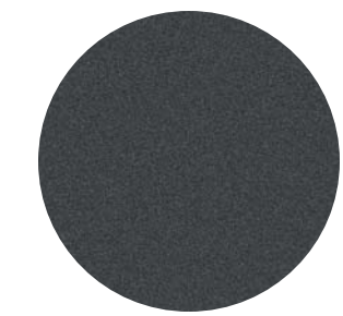
GRAPHITE LUSTER METALLIC Ebony Leatherette • Ebony Leather Graystone Leather