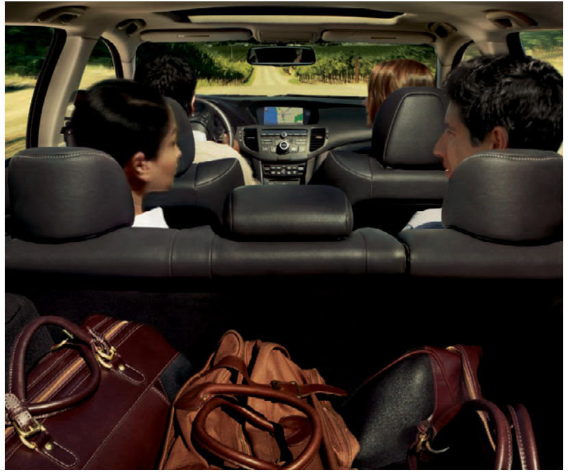
Acura reminds you to properly secure items in the cargo area.

Additional storage compartments found throughout the cabin, including six within easy reach of the driver, ensure that there's a place for everything.