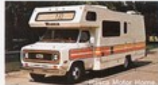
Argosy Motor Homes.