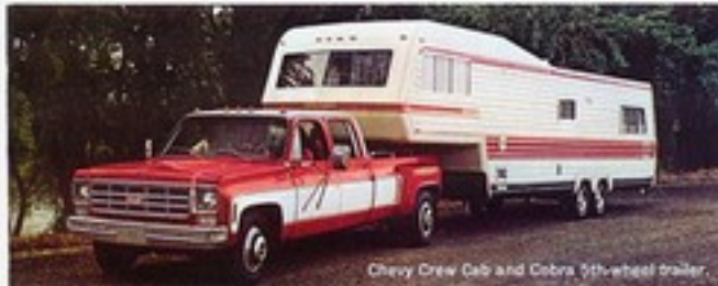
Chevy Crew Cab and Cobra 5th-wheel trailer.