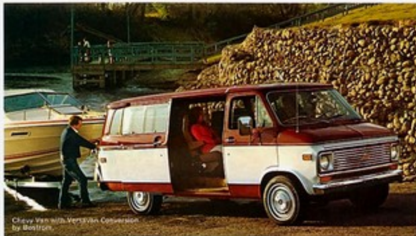
Chevy Van with Versavan Conversion by BoatPro.