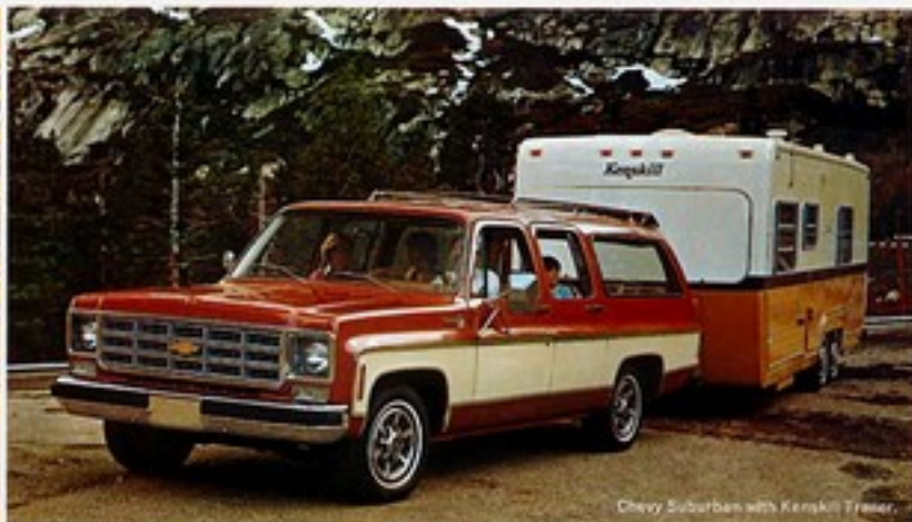
Chevy Suburban with Kenzie Trailer.