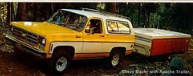
Chevy Blazer with Apache Trailer.