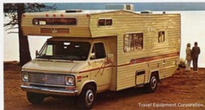
Travel Equipment Corporation.

Provides a firm, easy ride. A tough coil spring at each front wheel helps soak up most of the road shock before it can reach the driver and cargo.