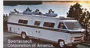
Sportscoach Corporation of America.

vent, Rally wheels for Series 10-20 models, whitewall tires, Soft-Ray tinted glass and chromed bumpers. Chevy Custom Vans are also available complete from custom shops and body builders and feature unique paint jobs, custom rear side windows and a wide range of interior appointments.