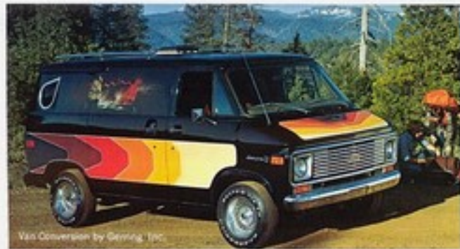
Van Conversion by Gering, Inc.

146-in. model with dual rear wheels and a 10,000-lb. GVW rating. Also included are a 350 V8 engine, power steering, Turbo Hydra-matic, front disc/rear drum brakes with tandem booster, heavy-duty Delco Freedom battery on the 146-in. wheelbase model, heavy-duty generator, front stabilizer bar and a 36-gallon fuel tank.