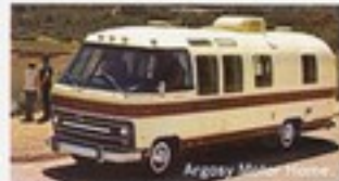
Argosy Motor Homes.