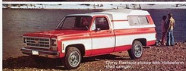
Chevy Fleetside pickup with slide-in floor camper.

"Big Dooley." Added carrying capacity for Fleetside pickups.