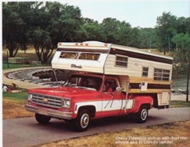
Chevy Fleetside pickup with dual rear wheels and El Cobra-20 camper.

With recommended chassis equipment, Chevy pickups can tow trailers up to 10,500 lbs. For specific equipment recommendations, see your Chevy dealer.