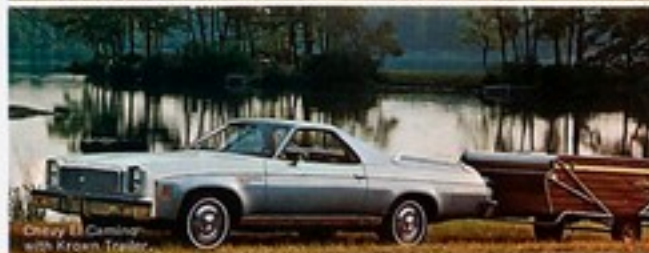
Chevy El Camino with Krown Trailer.

A Chevrolet design, the platform is bolted to the truck frame through prepanched holes in the frame. It accommodates a maximum trailer weight capacity of 7,000 lbs. on pickups and Suburbans, 6,000 lbs. on Blazer.