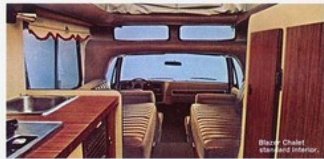
Blazer Chalet standard interior.

Blazer's suspension is engineered to provide an especially soft ride for 4-wheel-drive vehicles, on and off the road.