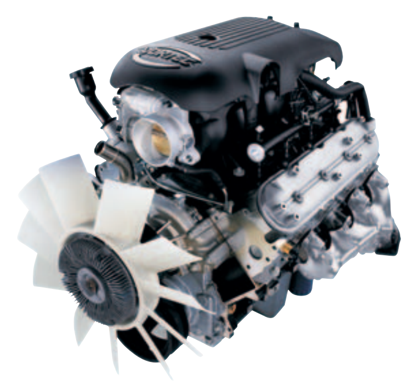
THE VORTEC 6000 V8 with 300 hp and 360 lb.-ft. of torque is standard on all Savana 2500 and 3500 passenger vans.

NO MATTER WHAT BALANCE OF POWER AND ECONOMY BEST MEETS YOUR NEEDS, Savana offers a proven Vortec engine that's right for you. The choices start with a 195-horsepower Vortec 4300 V6 and range up to a 300-horsepower Vortec 6000 V8 that can be ordered as an Alternative Fuel Compatible engine. Every Savana engine is paired with an electronically controlled four-speed automatic transmission with a standard Tow/Haul mode for improved performance when towing or handling heavy loads.