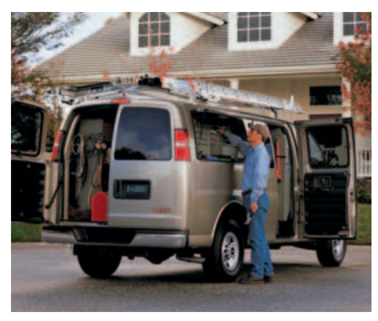
SAVANA CARGO VANS offer the added convenience of the available Savana Pro and Pro Plus Packages, which include 3 handy rear access panels.

SAVANA CARGO VANS ARE ENGINEERED to work hard over the long haul and are equipped with a range of standard and available convenience features, such as the Savana Pro and Pro Plus Packages. Newly available for 2006 is the Duramax 6600 Diesel with 250 horsepower and a prodigious 460 pounds-feet of torque. For more information on GMC Savana Cargo Vans, please ask your Sales Consultant for the GMC Commercial Trucks brochure.