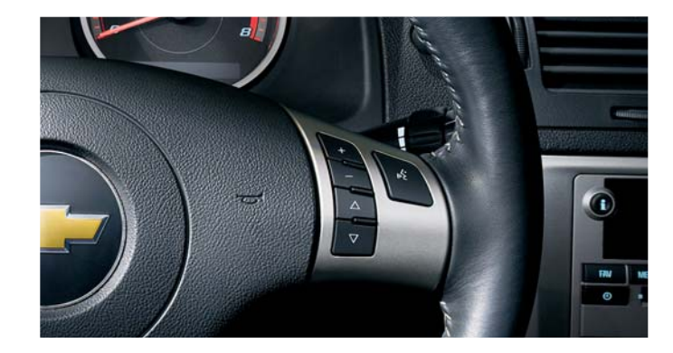
Steering wheel-mounted audio and cruise controls.