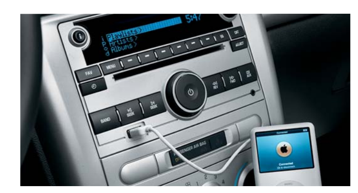
The NEW USB port, available in LT and SS models, connects a flash drive or select MP3 players<sup>2</sup> and offers complete functionality through Cobalt's stereo system. Flip through your tunes using the available steering wheel-mounted audio controls while the radio displays the playlist information.

From the wraparound cockpit that reveals the available white-faced Sport gauges to the standard front bucket seats, Cobalt 2LT with the available SPORT APPEARANCE PACKAGE feels track-worthy. | The steering wheel-mounted audio and cruise controls and the available NEW 🥂 Bluetooth® wireless technology for select compatible phones<sup>1</sup> help keep frequently used features within easy reach. | Available leather-appointed seating complements the standard LEATHER-WRAPPED STEERING WHEEL AND SHIFTER. | Cobalt comes with a great selection of interior fabrics and colors. | The available Sport Appearance Package also adds sleek exterior styling cues, including body-color front and rear Sport fascias and lower rocker moldings, 17-inch polished-aluminum wheels matched with LOW-PROFILE P205/50R-17 TIRES, a chrome exhaust tip, rear-mounted spoiler and front foglamps.