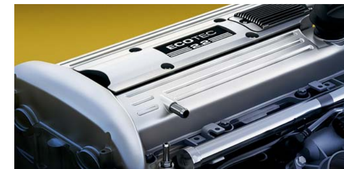
The 155-hp ECOTEC engine is standard in LS and LT models and features increased horsepower and fuel economy for 2009.

A serious ride with street-worthy specs. Two body styles offered in all three trim levels let you pick your passion. Cobalt XFE (LS and 1LT) features a 2.2L DOHC ECOTEC fourcylinder engine with 155 horsepower and an EPA ESTIMATED MPG 37 HIGHWAY (when equipped with the standard five-