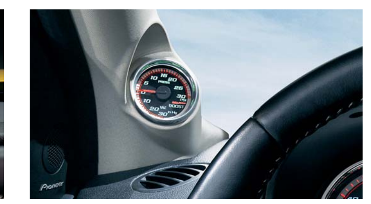
SS Turbocharged models include an A-pillar-mounted boost gauge.