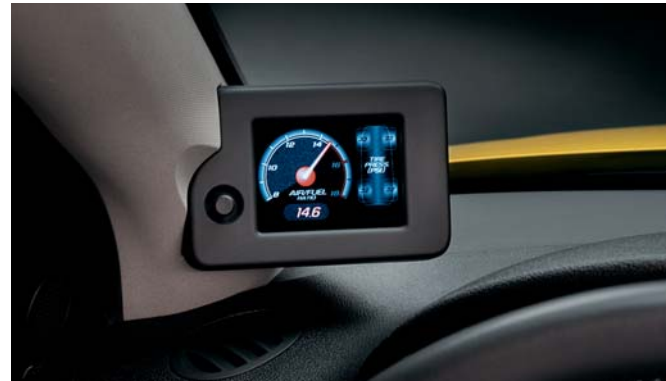
Available in SS Turbocharged Coupe, the Performance Display can be configured to show engine rpm, engine boost and more.

1 Based on GM 2008 Compact Car 3-Door/Coupe and Sedan segments and latest available competitive information.