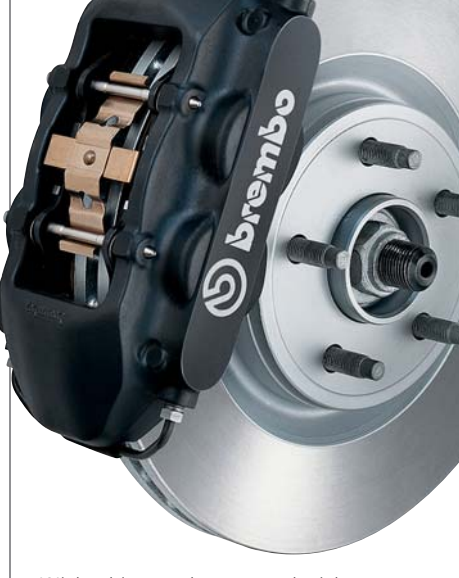
With a history that started with performance in mind and gained momentum with almost every bigname racing event, Brembo brakes are the preferred choice for any performance-oriented ride.