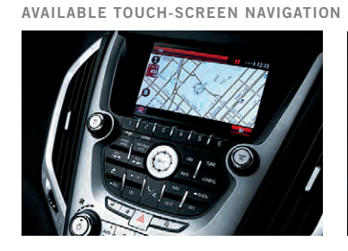
ANOTHER COMMANDING VIEW

Essentially an on-board computer, Terrain's available Touch-Screen Navigation System<sup>4</sup> allows you to choose either a 2-D or 3-D view of your driving (above, left). The system's 40GB hard drive stores a navigation database, freeing the system's DVD drive for entertainment. On vehicles equipped with this system, Terrain's standard rearview camera transmits the camera image of what is behind the vehicle to the NAV screen (above, right).