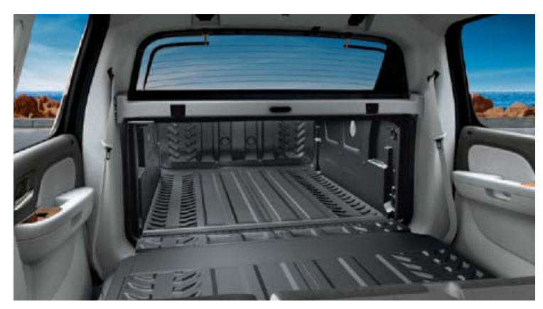
3 To utilize the full length of the cargo box, just lower the Midgate for a completely secured cargo area (when the three-piece cargo cover and rear window are in place).