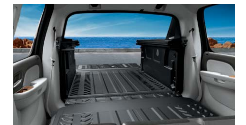
4 To complete the transformation, remove the rear window and three-piece cargo cover and lower the tailgate to transport items such as a small ATV.