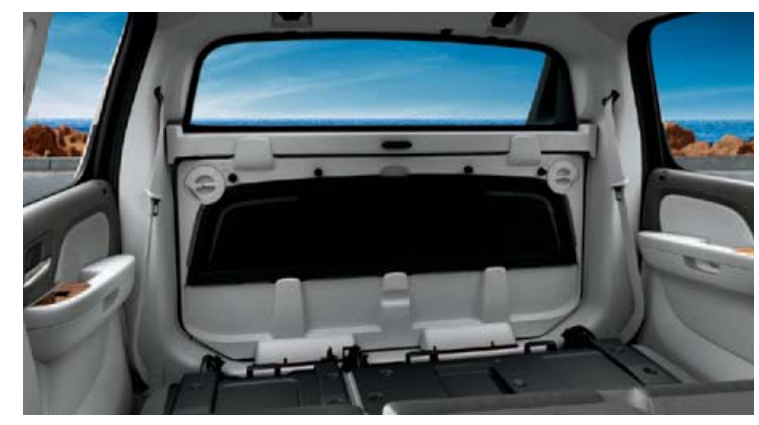
2 To begin converting Avalanche from an SUV to a pickup, simply lower the 60/40 split-folding bench seat. You can also stow the rear window inside the Midgate.