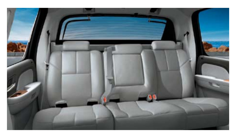
1 With the 60/40 split-folding rear-bench seatback and Midgate upright, Avalanche can be configured as a five- or six-passenger<sup>3</sup> SUV.