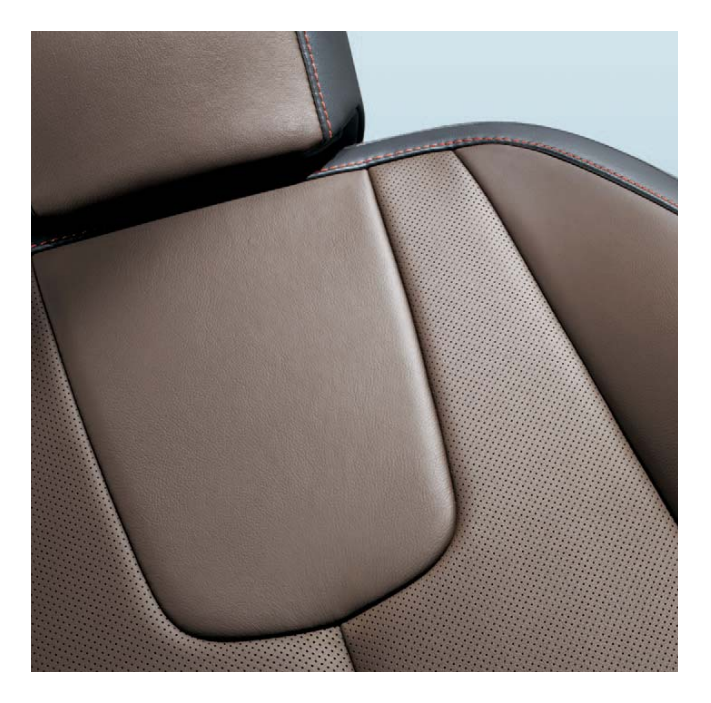
Style and comfort. The difference is in the details. Color-contrasted stitching catches your eye, and side bolsters comfortably fit your body.