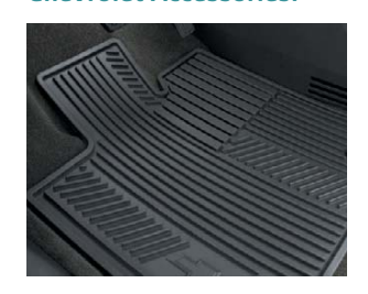
Protection Package includes all-weather floor mats and splash guards