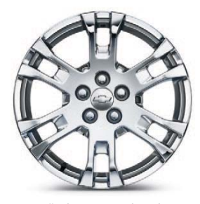
19" chrome wheel