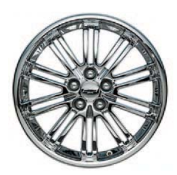
3. 18" ten-spoke cast-chrome wheel.

1 Extra-cost color. 2 Not available on LS and 1LT.