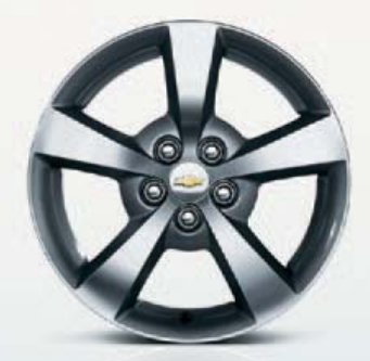
4. NEW 17"ultra bright aluminum wheel. Standard on 1LT.