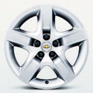
5. 17" fascia-spoke wheel with painted silver trim. Standard on LS