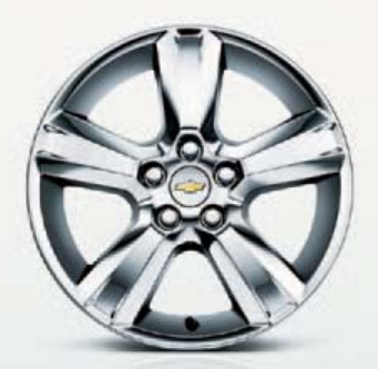
3. 17" Chrome-Tech aluminum wheel. Standard on 2LT.