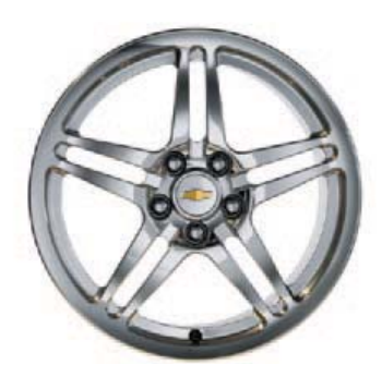
1. 17" forged-polished wheel.