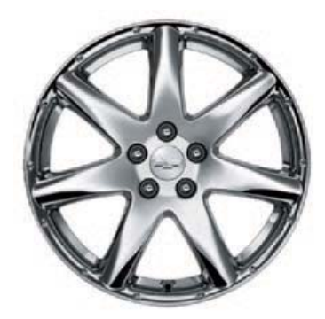
2. 18" seven-spoke cast-chrome wheel.