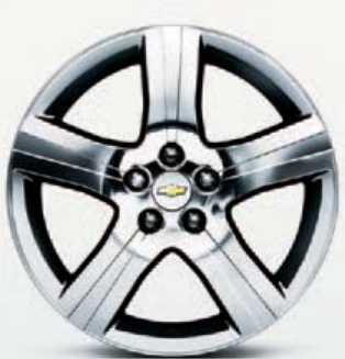
2. NEW 18" five-spoke Chrome-Tech aluminum wheel. Available on 2LT as part of available Engine Package.