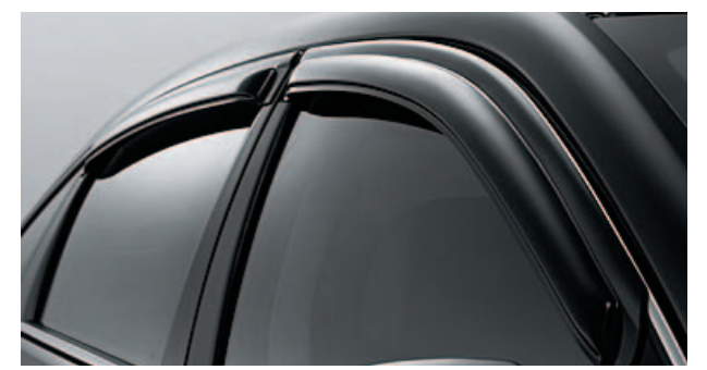
Side Window Weather Deflectors