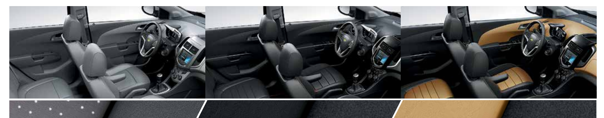
Jet Black/Brick Perforated Leatherette Seating Surfaces<sup>3</sup>

Dark Pewter-Color/Dark Titanium-Color Perforated Leatherette Seating Surfaces<sup>3</sup>