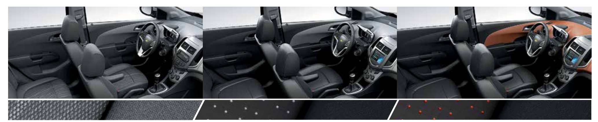
Dark Pewter-Color/Dark Titanium-Color Deluxe Cloth<sup>2</sup>

Jet Black/Brick Deluxe Cloth<sup>2</sup>