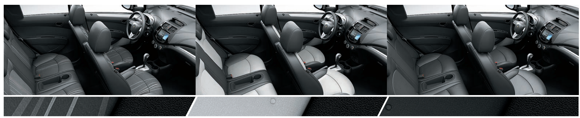
Dark Pewter-Color Cloth with Silver-Color Accents and Silver-Color Trim<sup>1,5</sup>