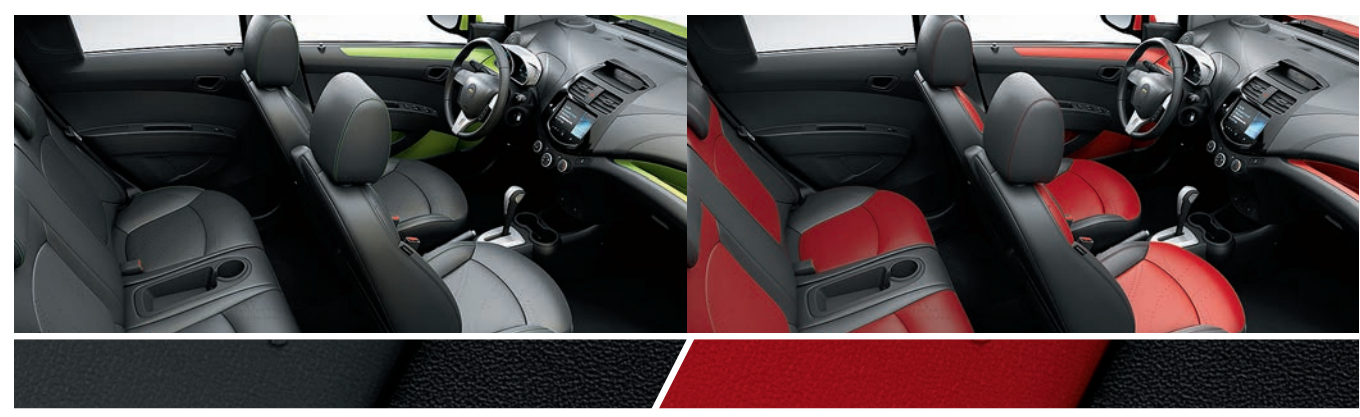
Dark Pewter-Color Leatherette and Green Trim<sup>2,6</sup>