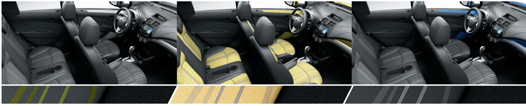
Dark Pewter-Color Cloth with Green Accents and Green Trim<sup>1,2</sup>