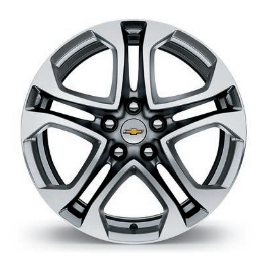
19" Ultra Bright Machined-Face Cast-Aluminum<sup>1</sup> (Standard)