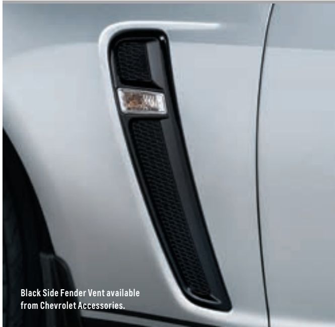
Black Side Fender Vent available from Chevrolet Accessories.