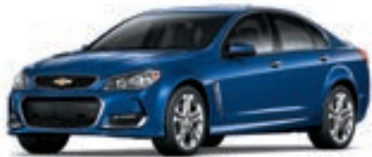
SLIPSTREAM BLUE METALLIC