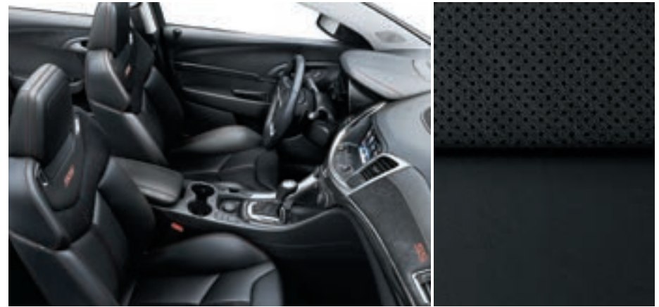
Jet Black Leather Appointments with Red Accent Stitching