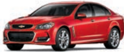
RED HOT 2