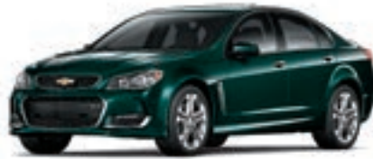
REGAL PEACOCK GREEN METALLIC