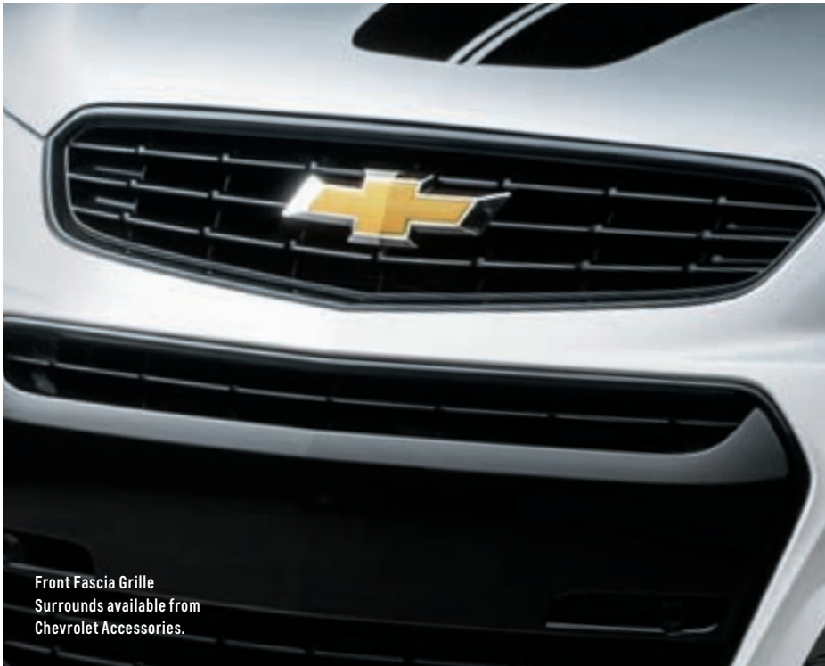
Front Fascia Grille Surrounds available from Chevrolet Accessories.