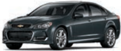
NIGHTFALL GRAY METALLIC