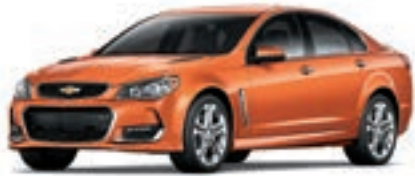
ORANGE BLAST METALLIC 1