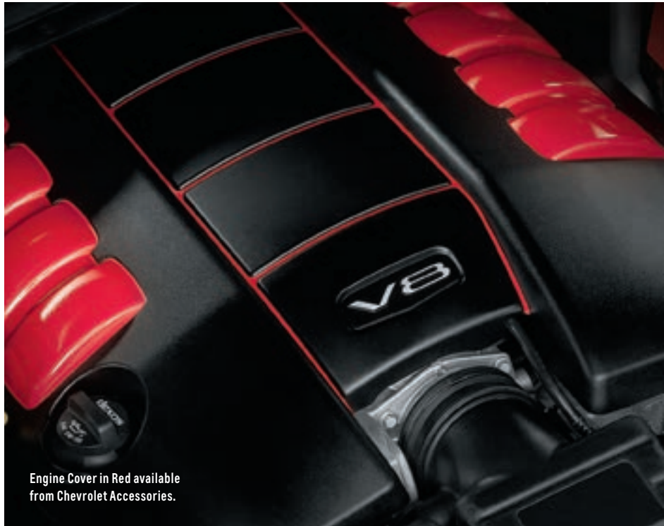
Engine Cover in Red available from Chevrolet Accessories.