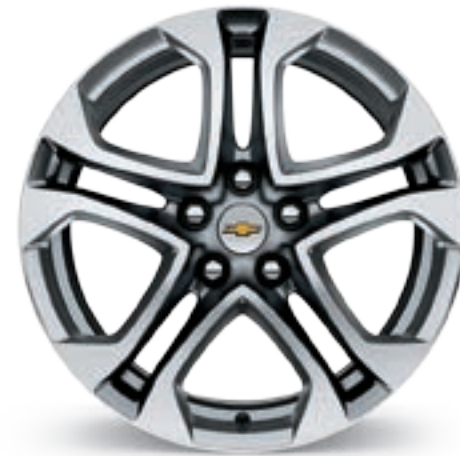
19" Ultra Bright Machined-Face Cast-Aluminum 2 (Standard)