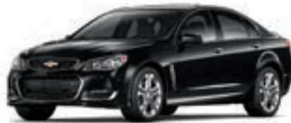
PHANTOM BLACK METALLIC