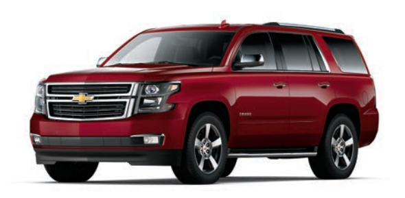
SIREN RED TINTCOAT<sup>1</sup>