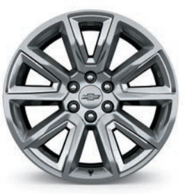
22" Premium Painted-Aluminum with Chrome Inserts (Available on LT and Premier)