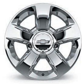
20" Chrome-Aluminum (Available on Premier; included with LT Signature Package)