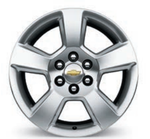
20" Polished-Aluminum (Standard on Premier; available on LS and LT)