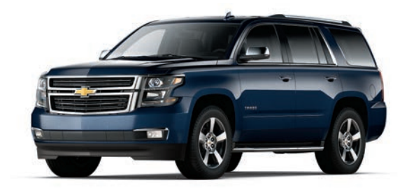
BLUE VELVET METALLIC