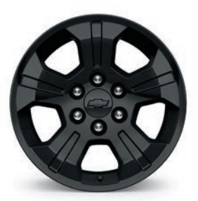
18" Black-Painted Aluminum (Included with Z71 Midnight Edition; late availability)