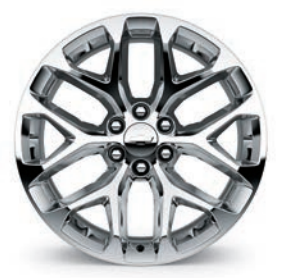
22" Chrome-Aluminum Multi-Featured Design (Available on LT and Premier)