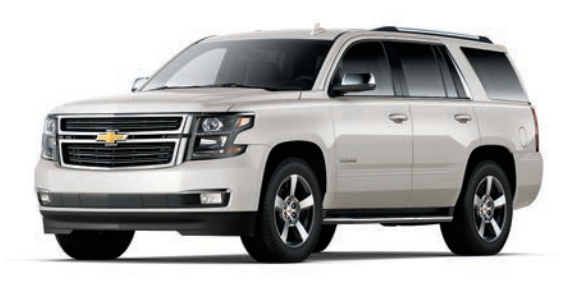
CHAMPAGNE SILVER METALLIC