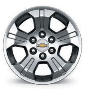
18" Painted-Aluminum (Available on LT; requires Z71 Off-Road Package)