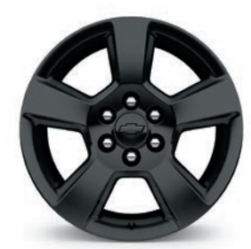
20" Black-Painted Aluminum (Included with LT Midnight Edition; late availability)