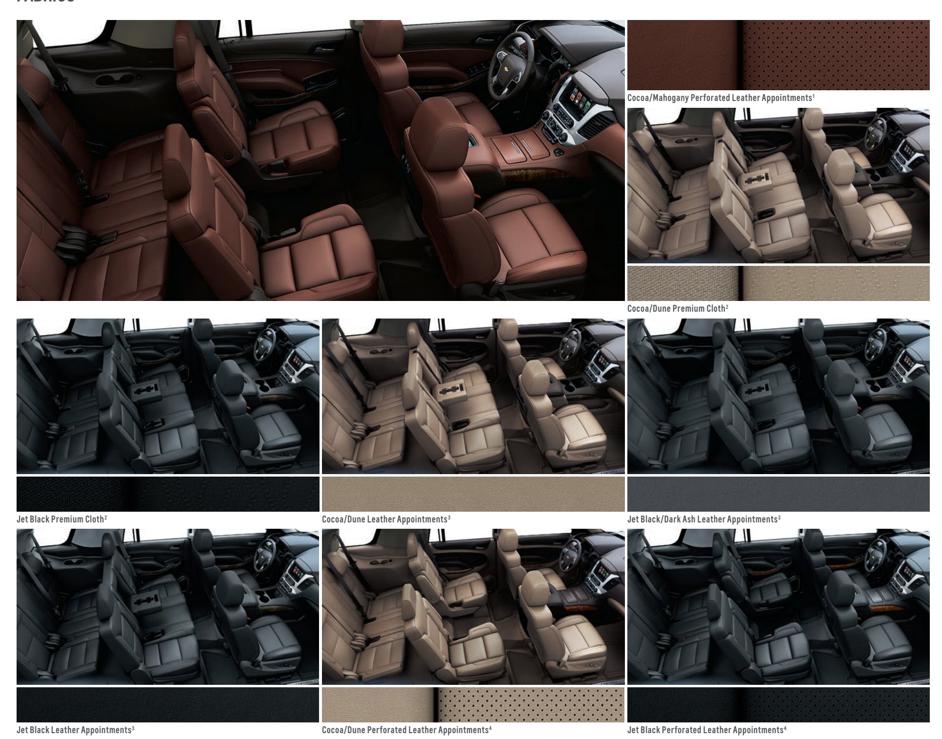
1 Available on Premier. Extra-cost color. 2 Standard on LS. 3 Standard on LT. 4 Standard on Premier.