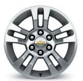
18" Aluminum with High-Polished Finish (Standard on LS and LT)