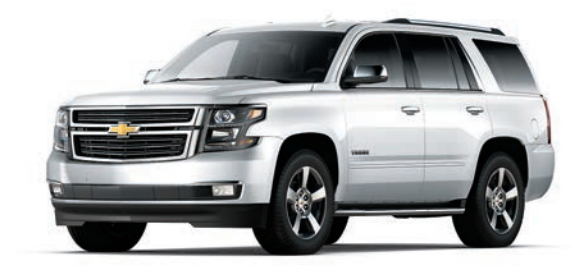
IRIDESCENT PEARL TRICOAT<sup>1,2</sup>