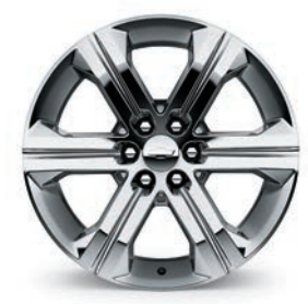
22" Chrome-Aluminum (Available on LT and Premier)