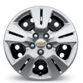
16" Steel with Painted Wheel Cover (Standard on LS FWD)