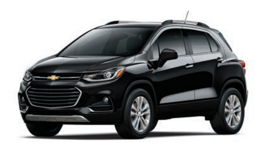
MOSAIC BLACK METALLIC