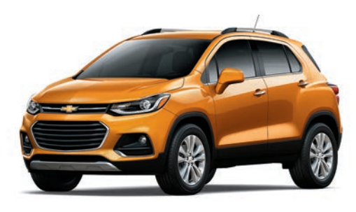
ORANGE BURST METALLIC<sup>2,3</sup>