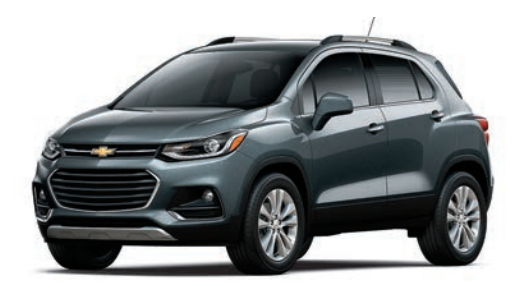
NIGHTFALL GRAY METALLIC<sup>2</sup>