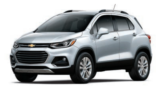
SILVER ICE METALLIC<sup>1</sup>