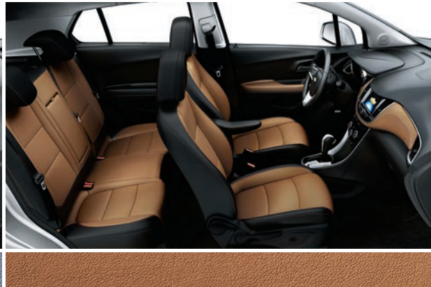
Brandy Leatherette with Black Leatherette Accents<sup>1</sup>