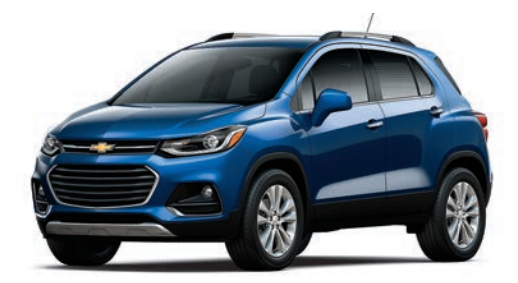
BLUE TOPAZ METALLIC1