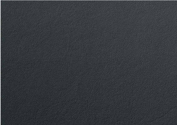
Jet Black Leatherette<sup>1</sup>