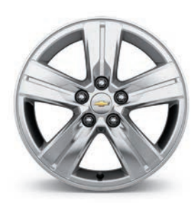
16" Painted-Aluminum (Standard on LS AWD and LT)