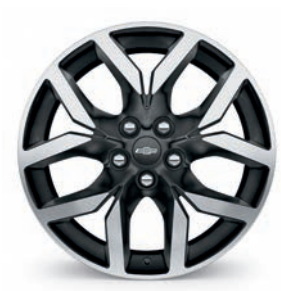
19" Special Midnight Edition Aluminum with Black-Painted Pockets (Available on LT and Premier)<sup>1</sup>