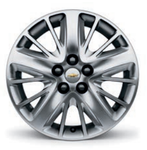
18" Steel with Fascia-Spoke Wheel Cover (Standard on LS)