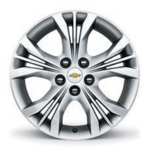
18" Painted-Alloy (Standard on LT)