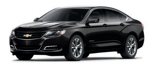
MOSAIC BLACK METALLIC<sup>3</sup>