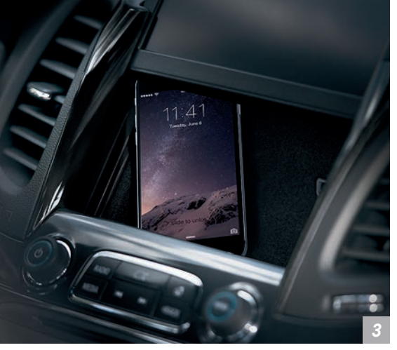
\underline{1} \ MyLink \ functionality \ varies \ by \ model. \ Full \ functionality \ requires \ compatible \ Bluetooth \ and \ smartphone, \ and \ USB \ connectivity \ for \ some \ devices. \ \underline{2} \ Visit \ my. chevrolet. \ com/learn \ for \ vehicle \ and \ smartphone \ compatibility. \ \underline{3} \ Not \ compatible \ with \ all \ devices.