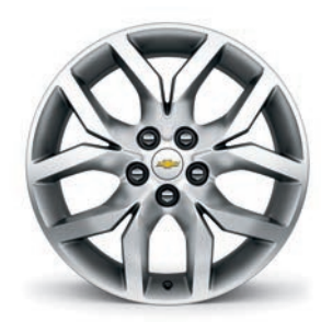
19" Machined-Face Aluminum (Standard on Premier)