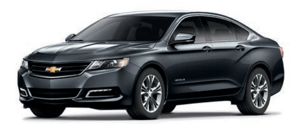
NIGHTFALL GRAY METALLIC