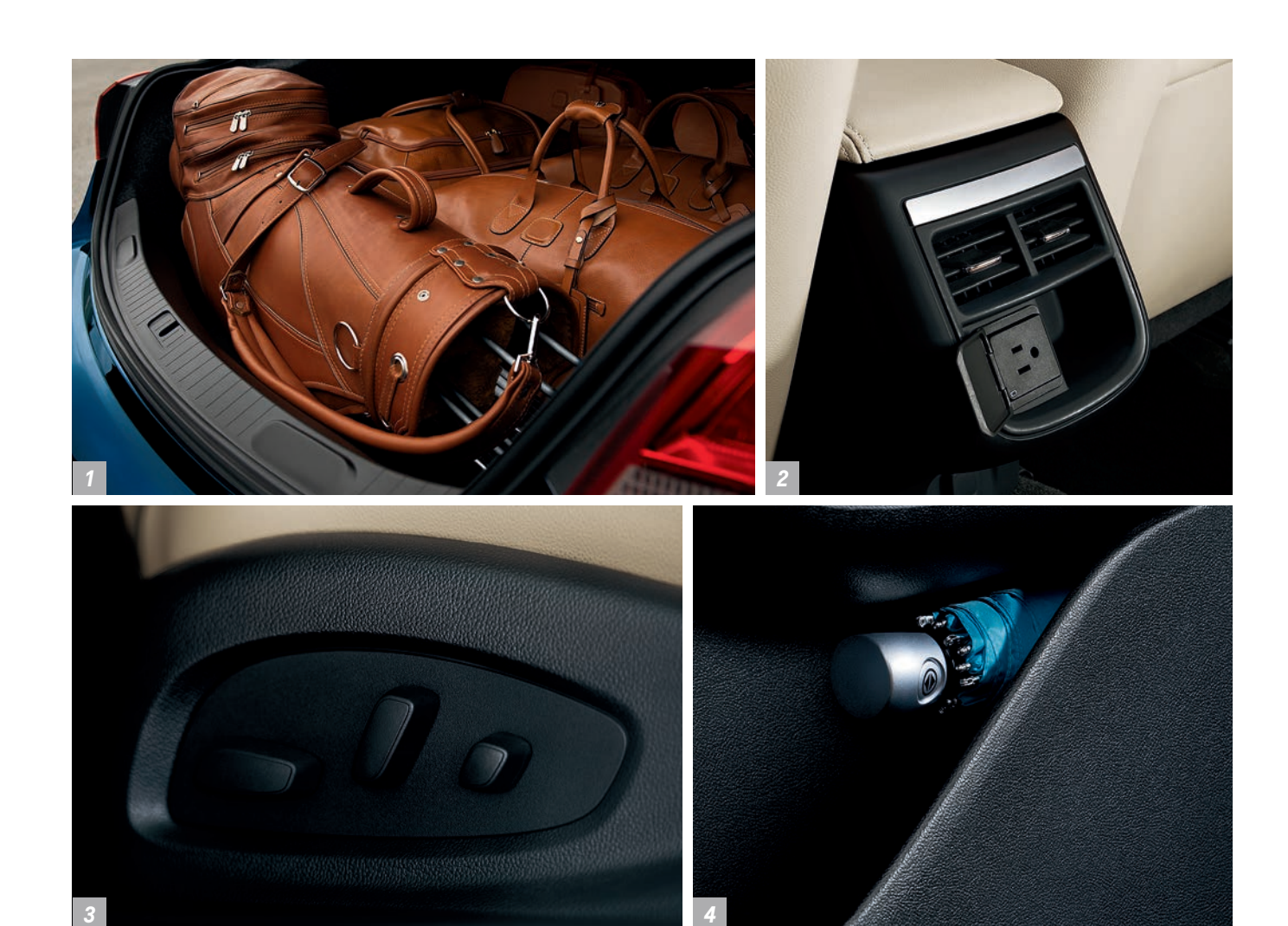
1 Cargo and load capacity limited by weight and distribution.