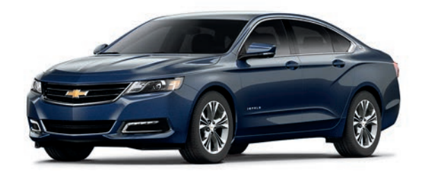
BLUE VELVET METALLIC