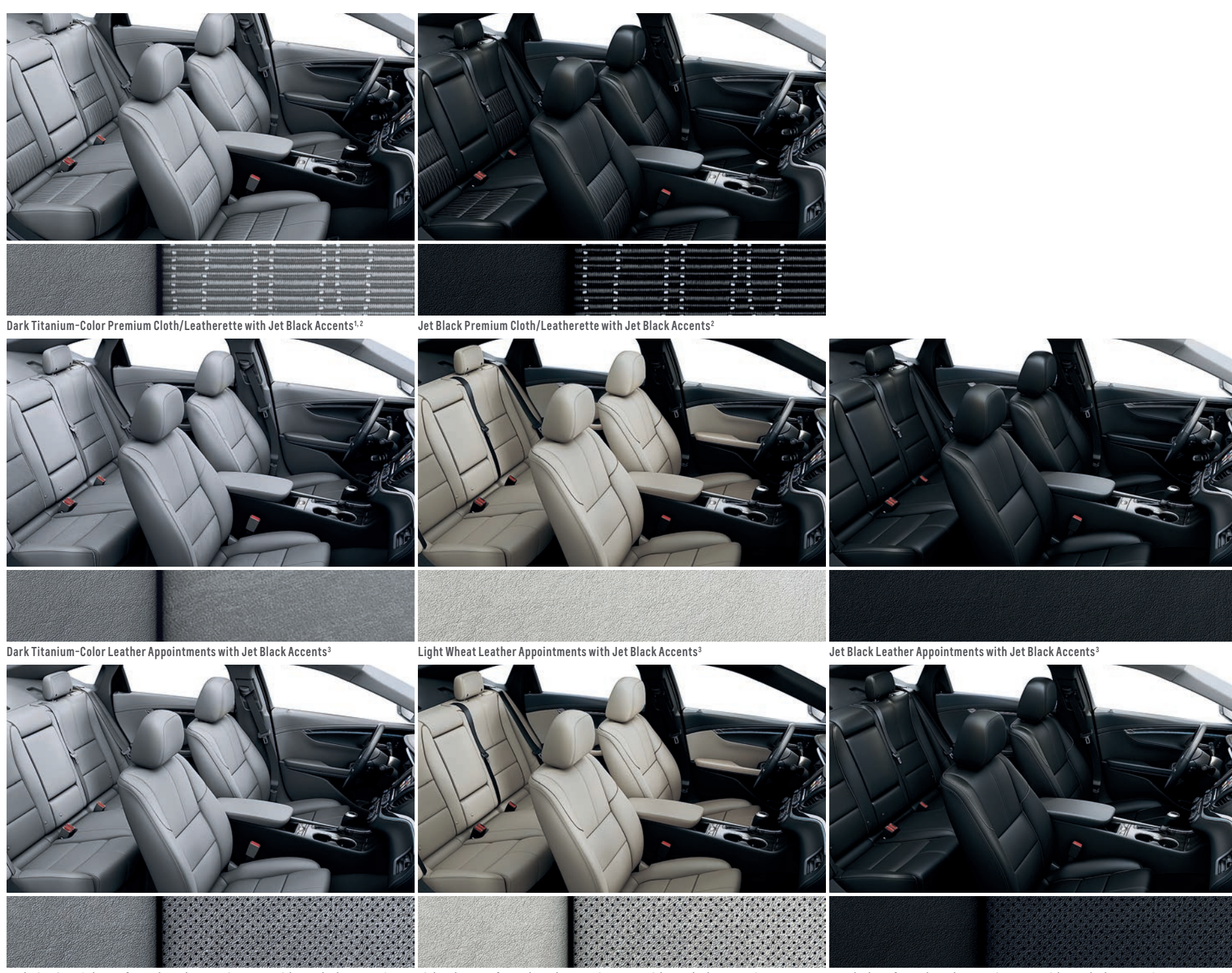
Dark Titanium-Color Perforated Leather Appointments with Jet Black Accents<sup>4</sup>