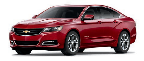
CAJUN RED TINTCOAT<sup>2,3</sup>