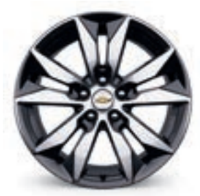
18" Aluminum (Available on LT with Sun and Wheels Package or Sport Package)