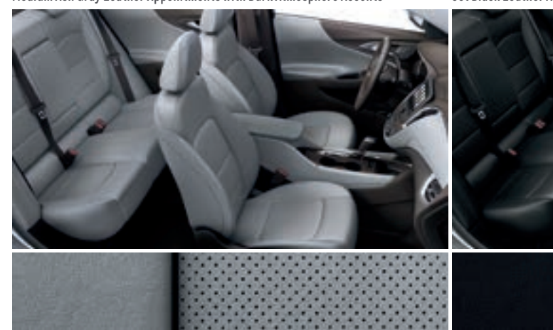
Medium Ash Gray Perforated Leather Appointments with Dark Atmosphere Accents<sup>7,9</sup> Jet Black Perforated Leather Appointments with Jet Black Accents<sup>9</sup>