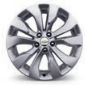
19" Aluminum (Available on Premier with Premier Sun and Wheel Package)