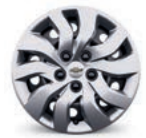
16" Steel with Painted Wheel Cover (Standard on L)