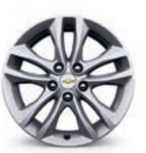
17" Aluminum (Standard on LT and Hybrid)