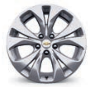
18" Aluminum (Standard on Premier)