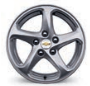
16" Aluminum (Standard on LS)