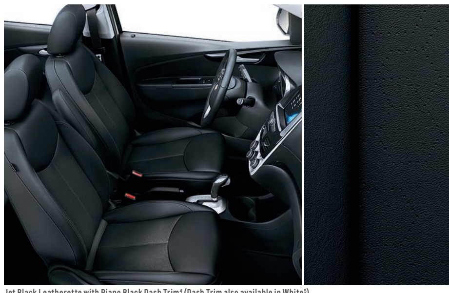
Jet Black Leatherette with Piano Black Dash Trim<sup>4</sup> (Dash Trim also available in White<sup>5</sup>)