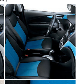
Jet Black Leatherette with Blue Seat Inserts and Blue Dash Trim8