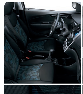
1LT in Piano Black, White, Beige or Blue) Inserts and Beige Dash Trim<sup>7</sup>