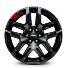
20" Gloss Black-Painted Aluminum with Red Accents (Available on Premier with Redline Edition)