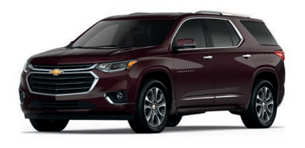
BLACK CURRANT METALLIC<sup>3,6</sup>