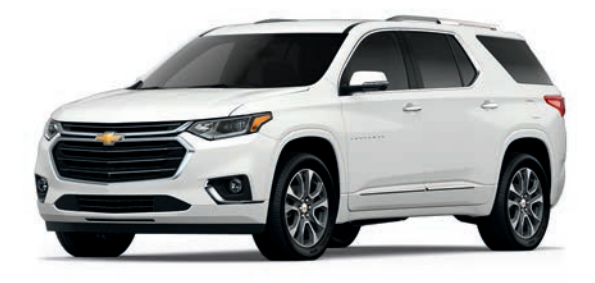
IRIDESCENT PEARL TRICOAT<sup>1,2,3</sup>