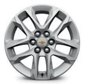
18" Bright Silver-Painted Aluminum (Standard on L and LS)