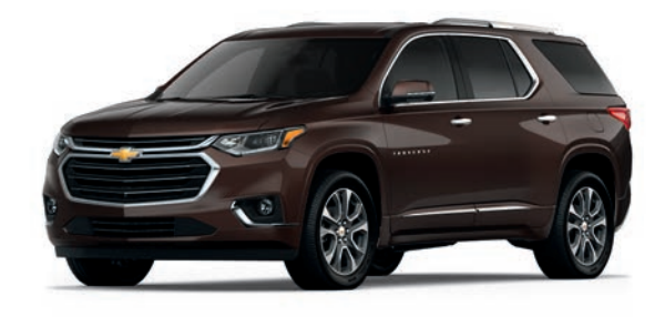
SABLE BROWN METALLIC<sup>7</sup>