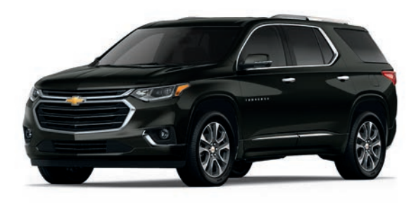
MOSAIC BLACK METALLIC<sup>1</sup>