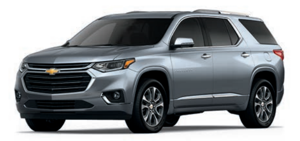
SATIN STEEL METALLIC<sup>4</sup>