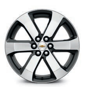
20" Machined-Face Aluminum with Technical Gray Pockets (Standard on LT Leather)