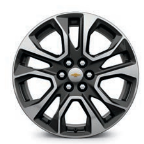
20" Argent Metallic Machined-Face Aluminum (Standard on Premier)