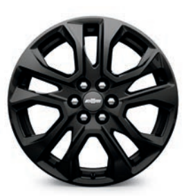
20" Dark Android-Painted Aluminum (Standard on RS)