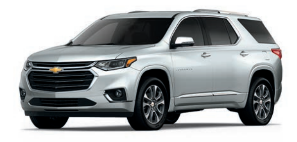
SILVER ICE METALLIC<sup>1,5</sup>