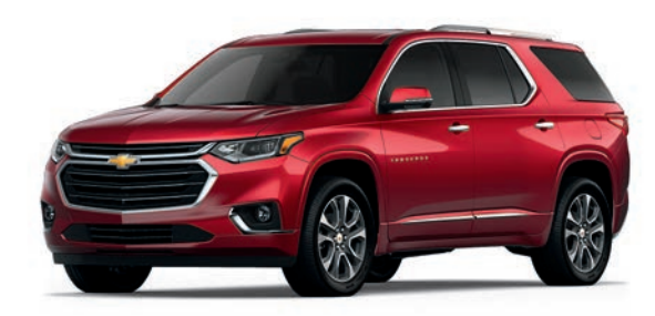
CAJUN RED TINTCOAT<sup>2,3</sup>