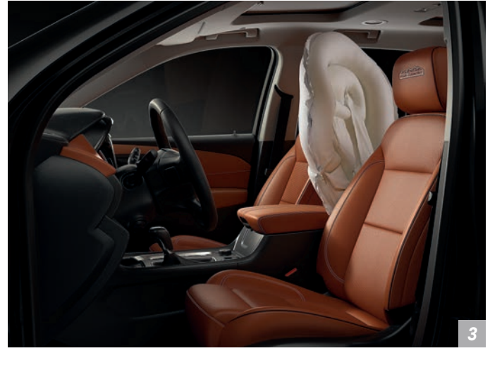
1 Air bag inflation can cause severe injury or death to anyone too close to the bag when it deploys. Be sure every occupant is properly restrained. A NOTE ON CHILD SAFETY: Always use safety belts and the correct child restraint for your child's age and size, even with air bags. Even in vehicles equipped with the Passenger Sensing System, children are safer when properly secured in a rear seat in the appropriate infant, child or booster seat. Never place a rear-facing infant restraint in the front seat of any vehicle equipped with an active frontal air bag. See the Owner's Manual and the child safety seat instructions for more safety information.