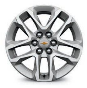
18" Bright Silver-Painted Machined-Face Aluminum (Standard on LT Cloth)