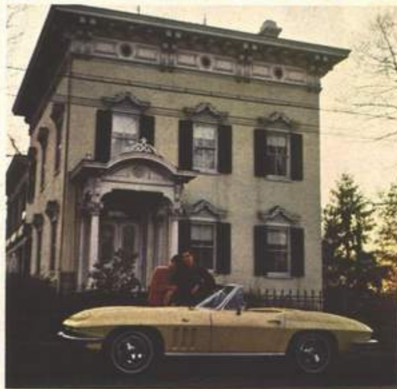
Top Right: Corvair Corsa Convertible in Aztec Bronze.