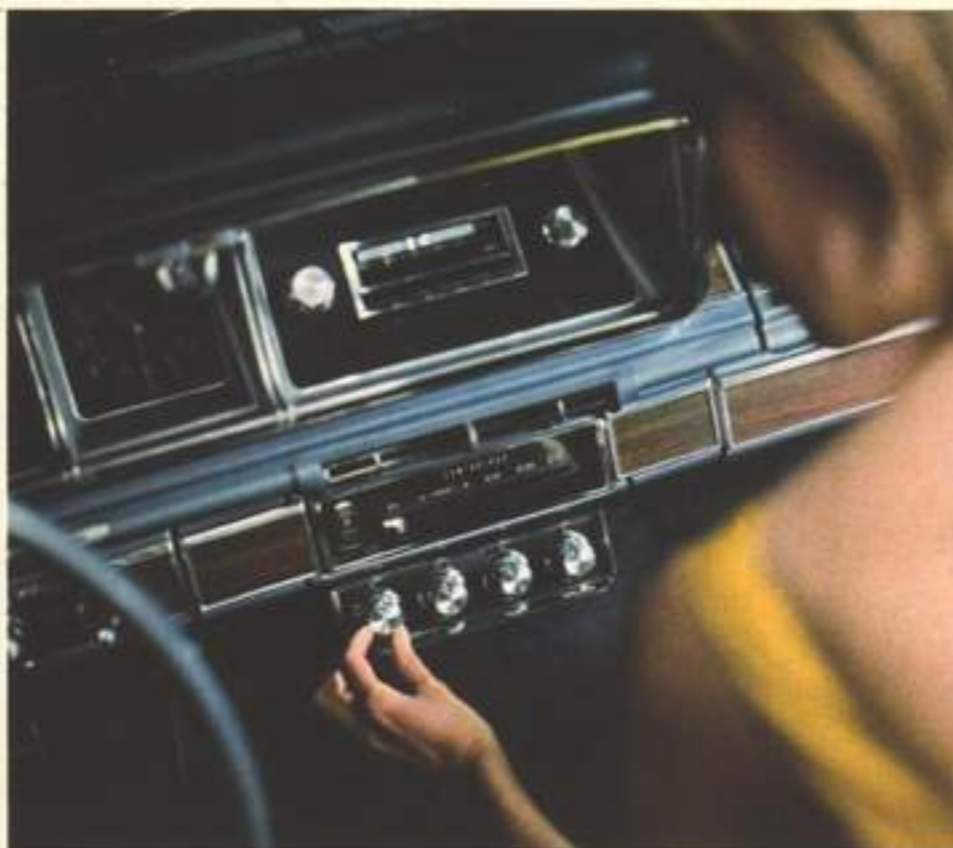
Top Center: AM/FM RADIO WITH FM STEREO MULTIPLEX – the first ever offered in an automobile – gives you stereo sound via four speakers, two front and two rear.