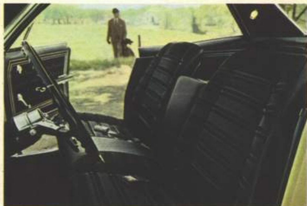
Top: Caprice Custom Coupe in Chateau Slate with black vinyl roof covering you can order.