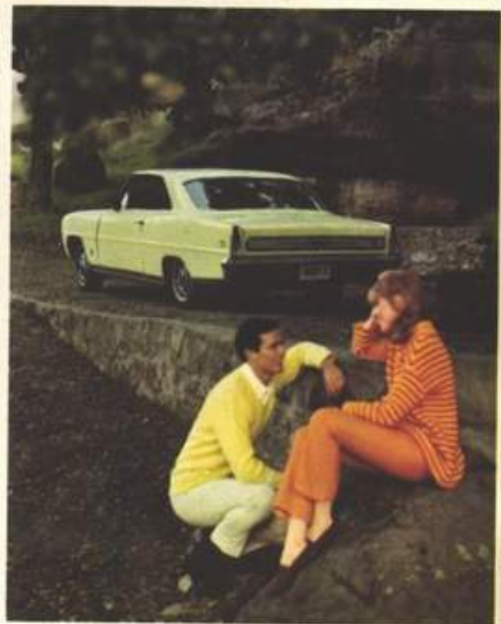
Top: Chevelle SS 396 Sport Coupe in Ermine White.