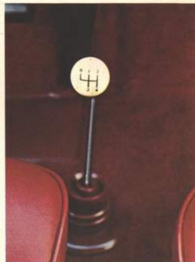
Top Right: FULLY SYNCHRONIZED 4-SPEED , as shown here in a Corvair, is Chevrolet's sportiest and most versatile gearbox. 4-Speed is also available for Chevrolet, Chevelle, Chevy II and Corvette, depending on engine specified.