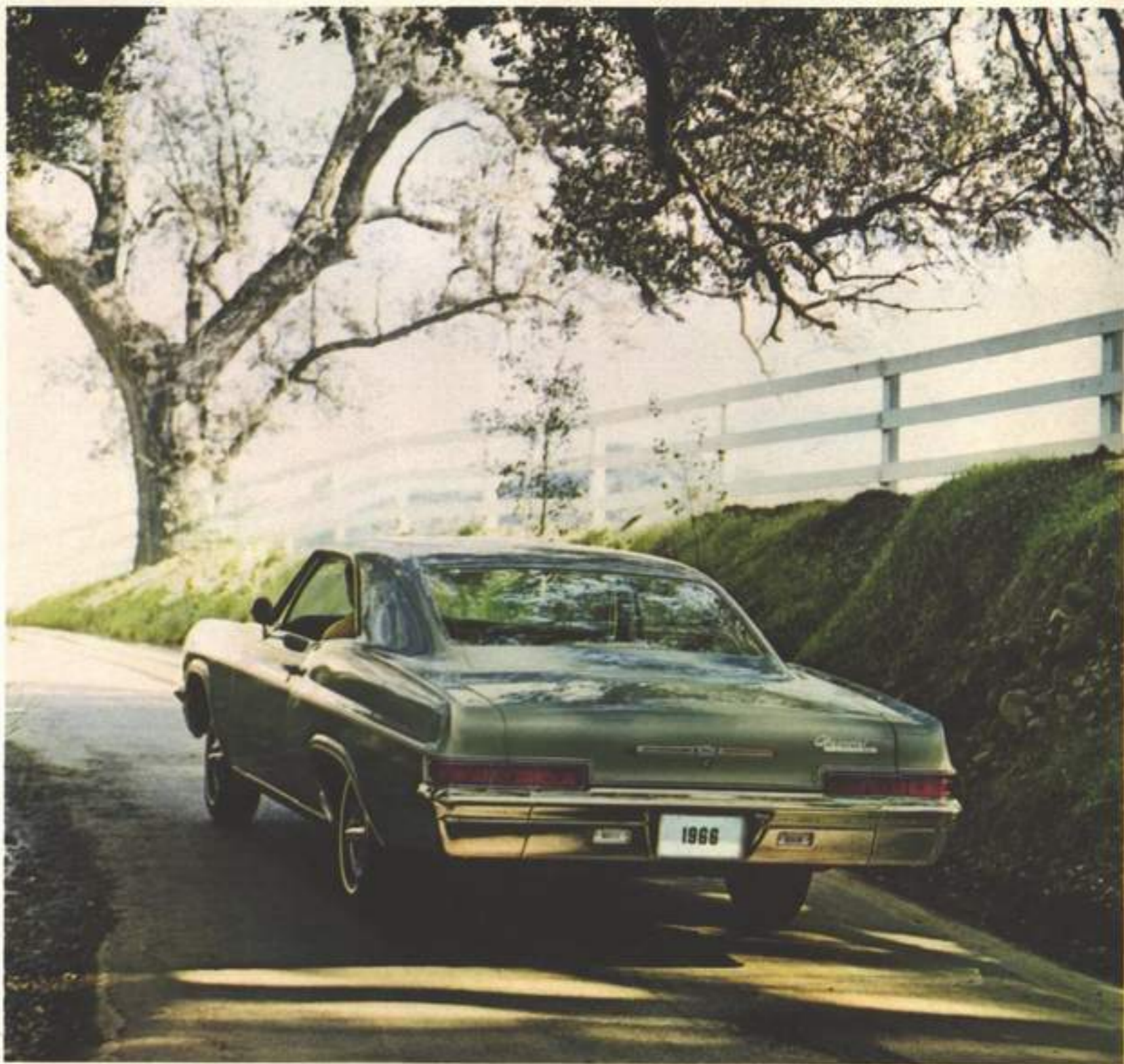
Above: Impala Super Sport Coupe in Willow Green with standard front bucket seats.

The famous Chevrolet ride you now enjoy is even smoother for '66! That's quite an engineering feat . . . and one more reason why Chevrolet is No. 1. Other reasons include the six popular Impala models: sport coupe, sport sedan, convertible, 4-door sedan, 2- and 3-seat station wagons; plus the Impala Super Sport Coupe and Convertible. Impala is designed to offer you a wide choice of luxurious interior colors; 15 Magic-Mirror exterior colors, too. Like all Chevrolets, Impala has many built-in quality features such as flush-and-dry rocker panels. Standard Impala engines, depending on model selected, are the 195-hp V8 and new 155-hp Six. Five other V8s including the much-praised 325-hp Turbo-Jet 396 can be ordered. And you can shift for yourself easily with the new standard 3-Speed because now it's fully synchronized in all forward gears. Or, depending on the engine, specify any of four other transmissions. After you take delivery of your Chevrolet the way you want it, relax. The Chevrolet way of building in quality will make your new Chevrolet easy to care for and a pleasure to drive. Also helps give Chevrolet its traditionally high resale value.