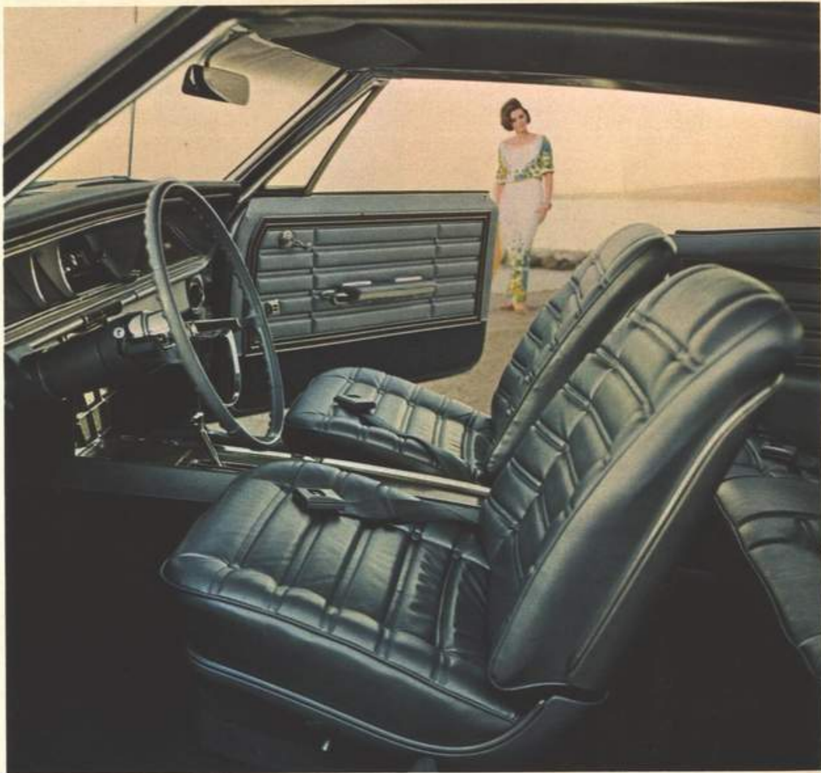
Above: Caprice Custom Coupe interior in blue with Strato-bucket front seats you can specify.

We had you in mind when we created the new Caprice series. We knew you'd like these V8-powered models: stately custom sedan; custom coupe with a roofline unlike any other car; 2- and 3-seat custom wagons distinguished by side panels with the look of hand-rubbed walnut. Obviously, the kind of meticulous Fisher Body coachwork Chevrolet owners have come to expect. You'll find Caprice is inwardly luxurious, too. Completely color-keyed in rich fabrics. Highlighted by insets that bring you the look of hand-rubbed walnut. Deluxe appointments: electric clock, courtesy light switches at every door, thick foam-cushioned seats, bright metal framing on all foot pedals. For the custom coupe, you can even order new Strato-bucket front seats with center console, special instrumentation and padded lower dash. Naturally, there's much much more you should know about these new Chevrolets, so visit your dealer and his sales staff for a Caprice presentation and demonstration drive. They'll be glad to serve you.