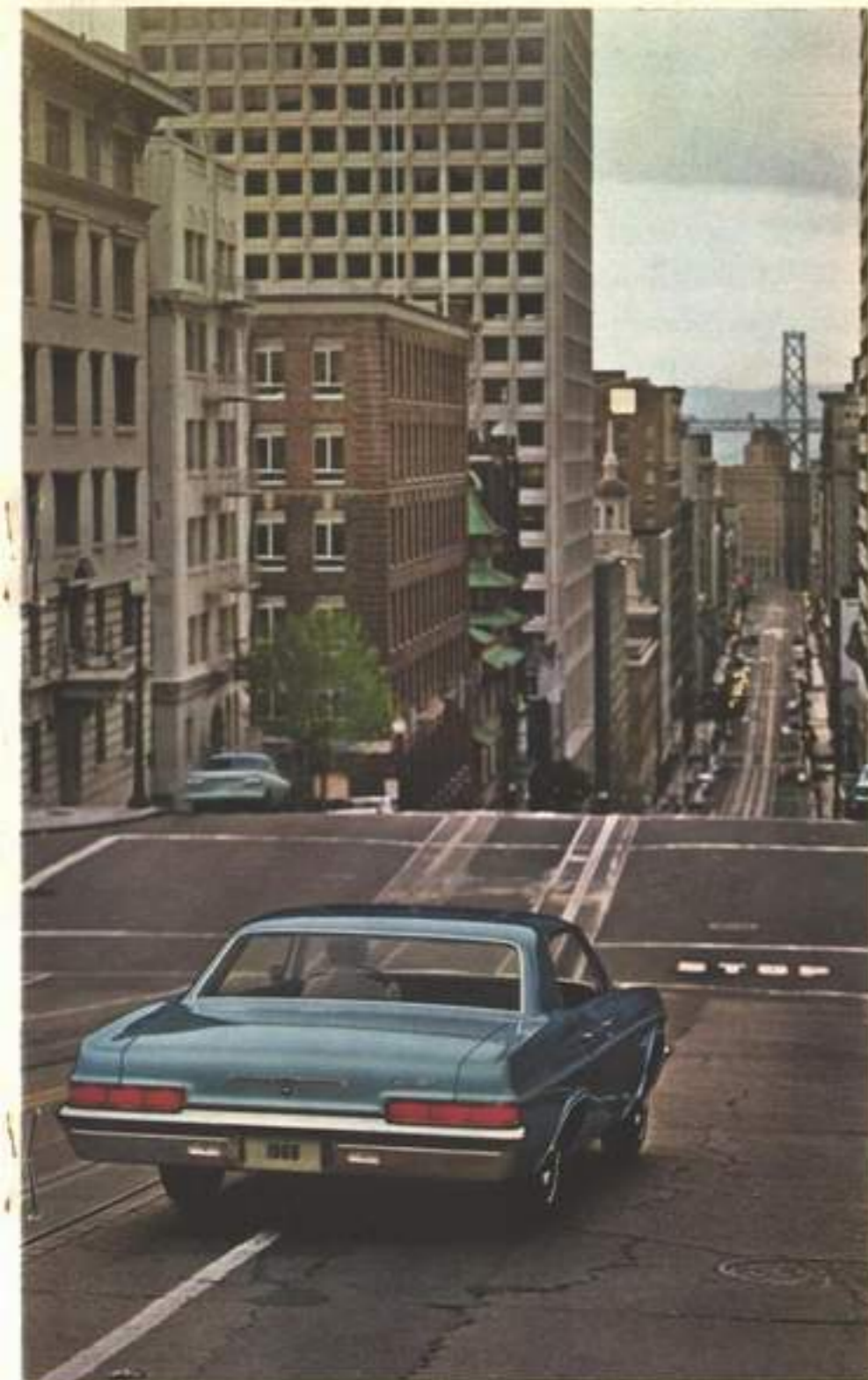
Above: POWER BRAKES provide dependable, steady stopping power; take one-third of the effort out of braking, too, as less pedal pressure is needed.