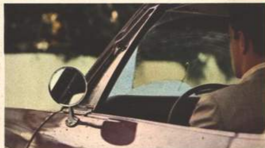
Top Left: Padded instrument panel, padded sun visors and shatter-resistant inside rearview mirror on a Chevy II Nova Super Sport Coupe.