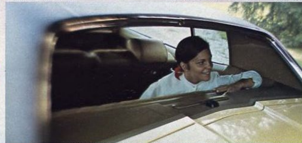
NEW REAR WINDOW STYLING FOR IMPALA CUSTOM AND CAPRICE COUPES