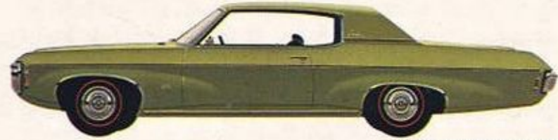
SS 427 CUSTOM COUPE