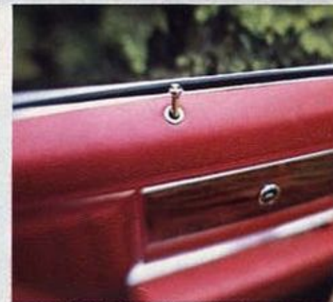
IMPROVED DOOR LOCK BUTTON LOCATION