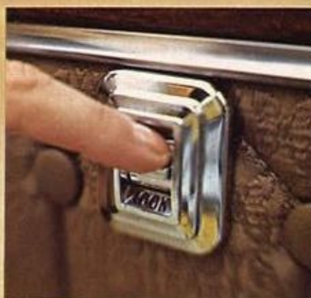
POWER DOOR LOCK SYSTEM