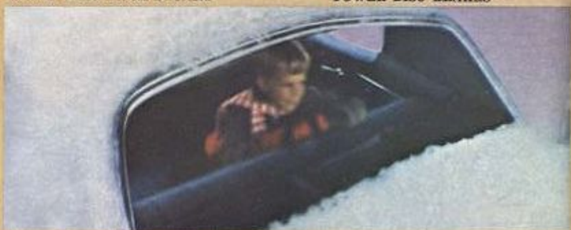
REAR WINDOW DEFROSTER