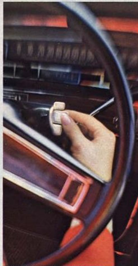
ANTI-THEFT LOCK SYSTEM