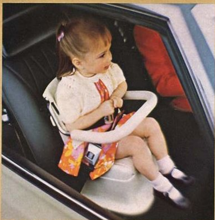
CHILD SAFETY SEAT