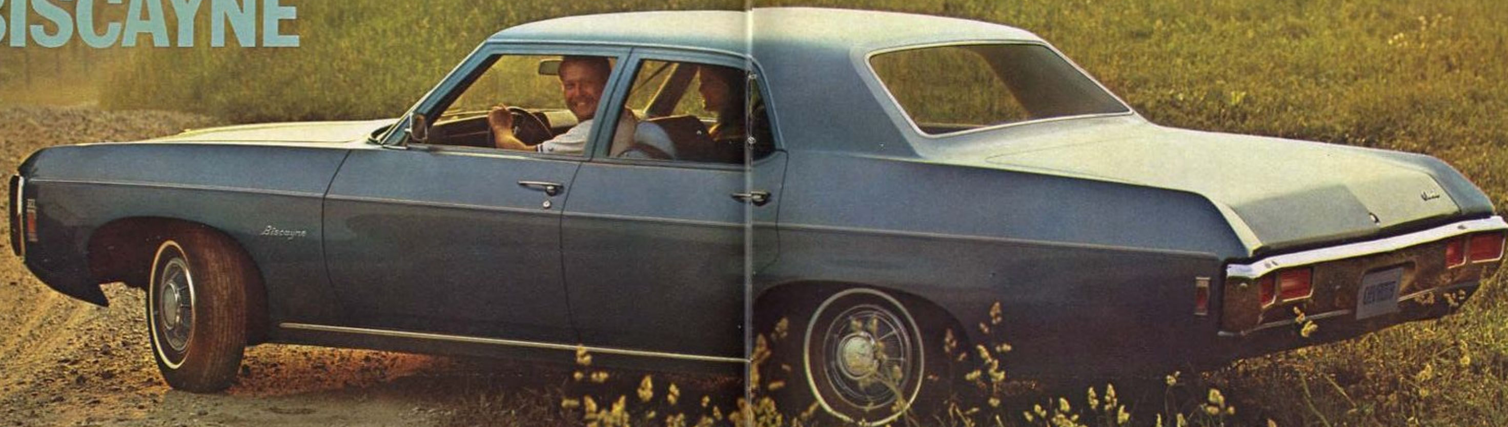
▲ BISCAYNE 4-DOOR SEDAN