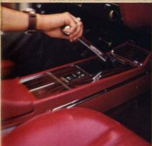
4-SPEED TRANSMISSION AND CONSOLE