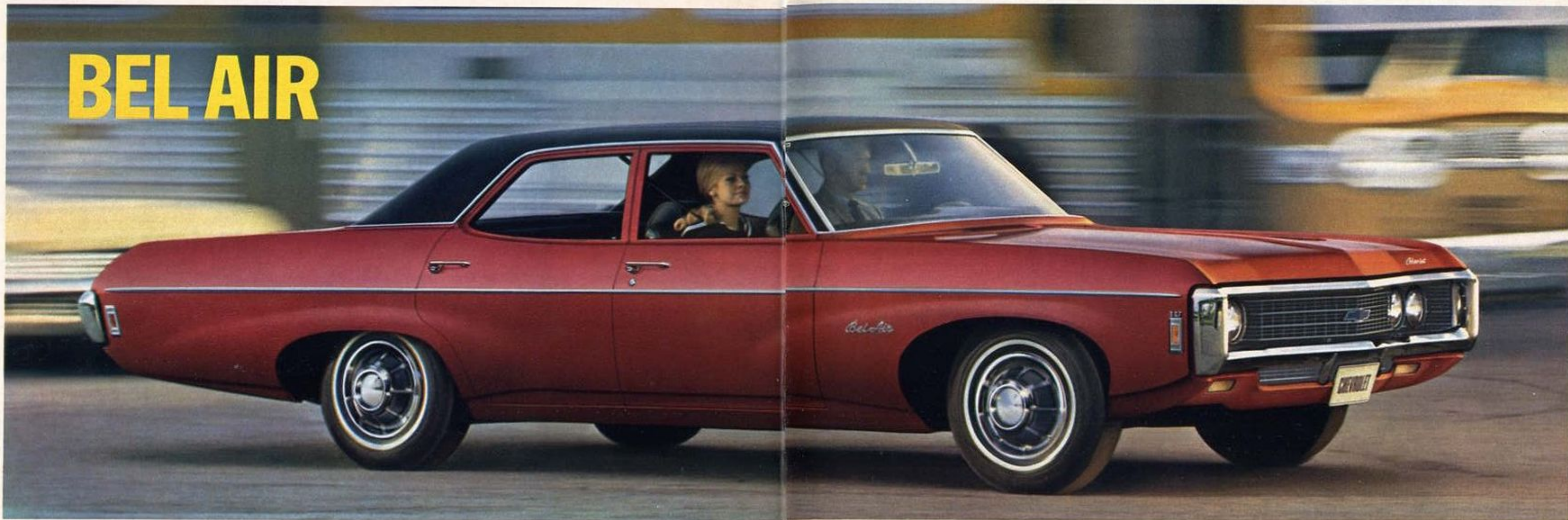
▼ BEL AIR 2-DOOR SEDAN