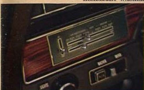
FOUR-SEASON AIR CONDITIONING