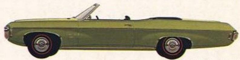
SS 427 CONVERTIBLE