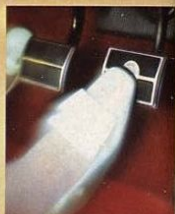
POWER DISC BRAKES