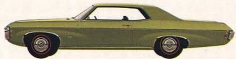
SS 427 SPORT COUPE