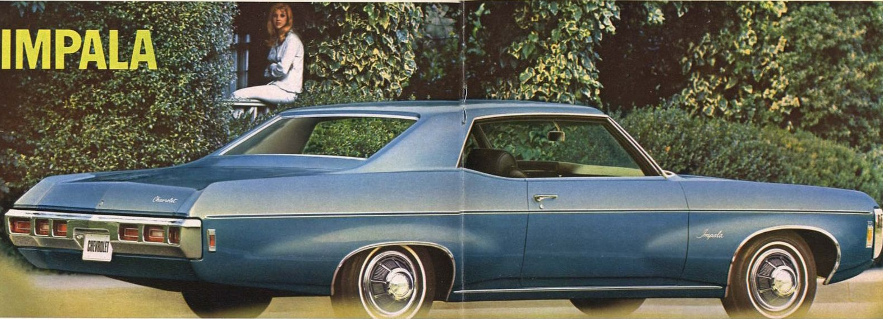
▲ IMPALA SPORT COUPE