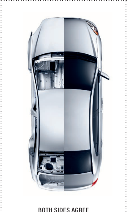
For left-brain thinkers and right-brain dreamers. The 2008 Hyundai Accent.

We also believe in a warranty that lasts twice as long as the average car loan. Not to mention the average car warranty.