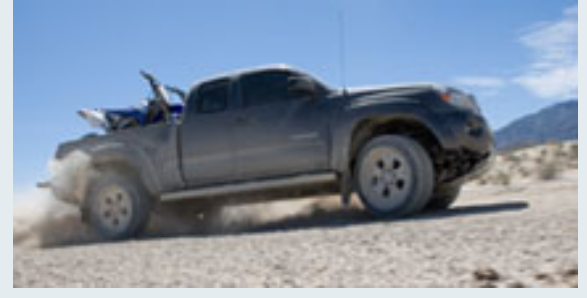
4x4 Access Cab in Magnetic Gray Metallic with available TRD Off-Road Package, accessory front skid plate, tube steps and bed extender