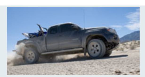
4x4 Access Cab in Magnetic Gray Metallic with available TRD Off-Road Package, accessory front skid plate, tube steps and bed extender