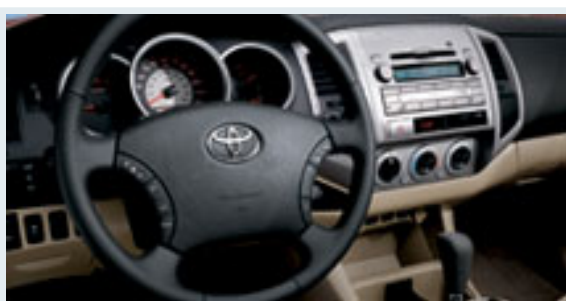
2009 Double Cab SR5 interior shown in Sand Beige