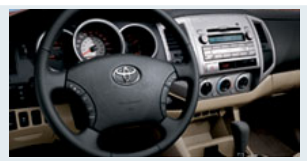
2009 Double Cab SR5 interior shown in Sand Beige