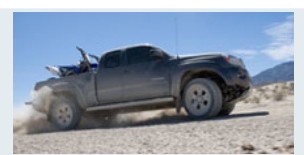
4x4 Access Cab in Magnetic Gray Metallic with available TRD Off-Road Package, accessory front skid plate, tube steps and bed extender