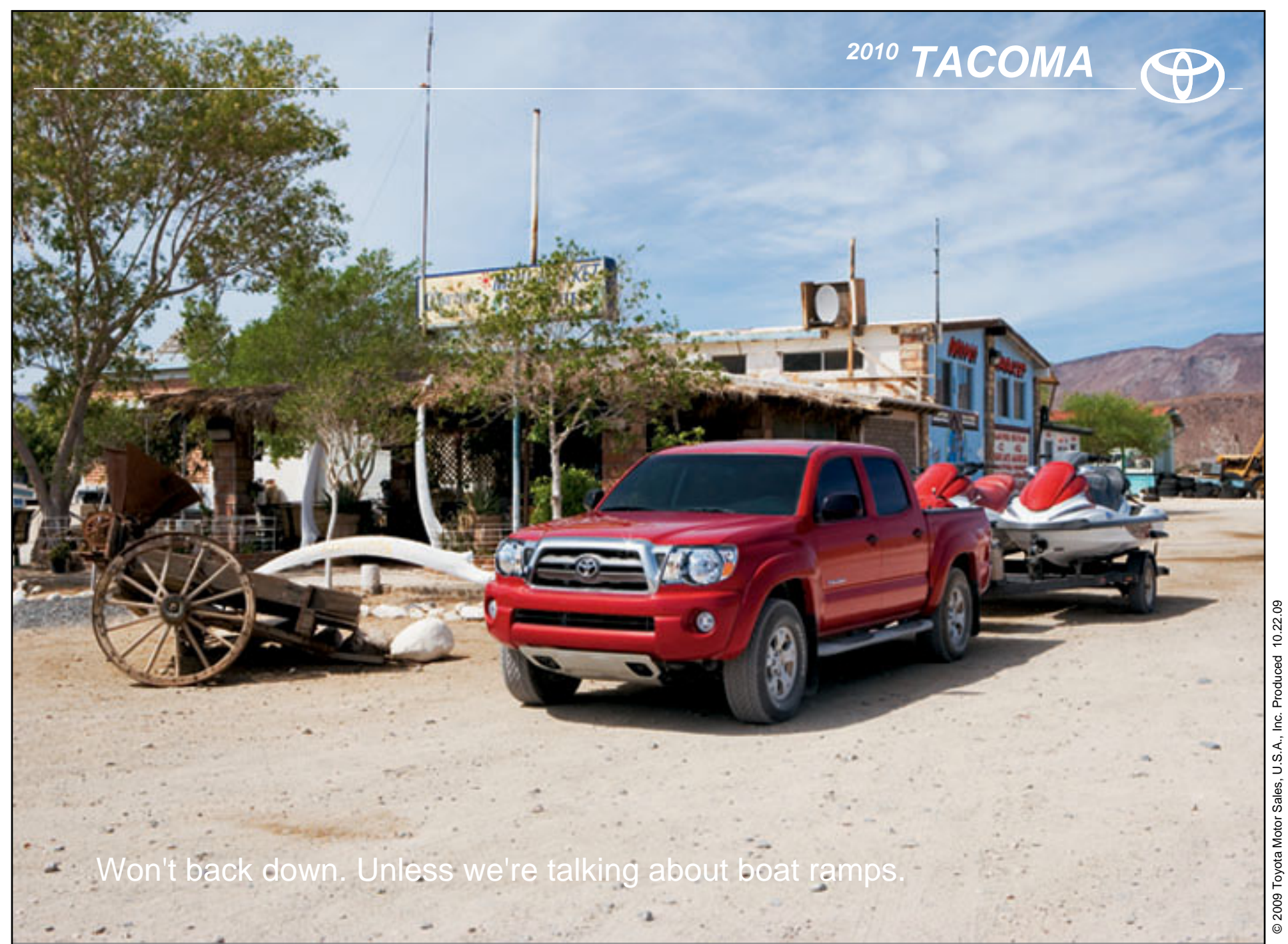
DAGE 1 of 15