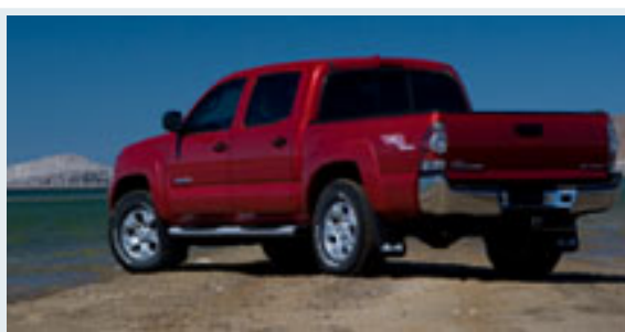
4x4 Double Cab shown in Barcelona Red Metallic with available TRD Off-Road Package, V6 Tow Package, accessory front skid plate and tube steps